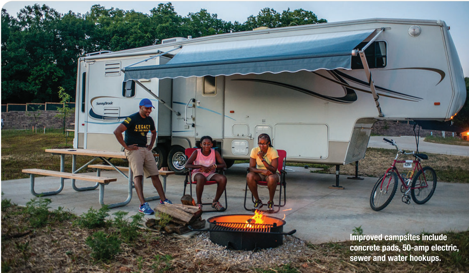
Improved campsites include concrete pads, 50-amp electric, sewer and water hookups.