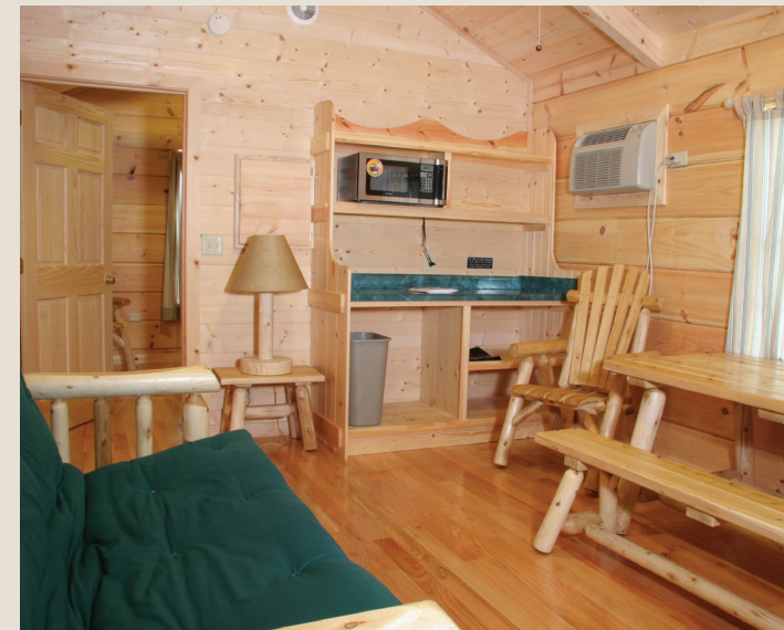
Camper Cabin Interior

Missouri state parks have featured camper cabins for more than 15 years. Camper cabins provide a low cost overnight opportunity for visitors that want to experience state parks, but might not own camping equipment, and are a very popular choice among families. The occupancy for camper cabins is consistently high around the state, demand exceeding availability. The camper cabins are placed on existing campsites and guests utilize the campground restroom and showerhouse facilities.