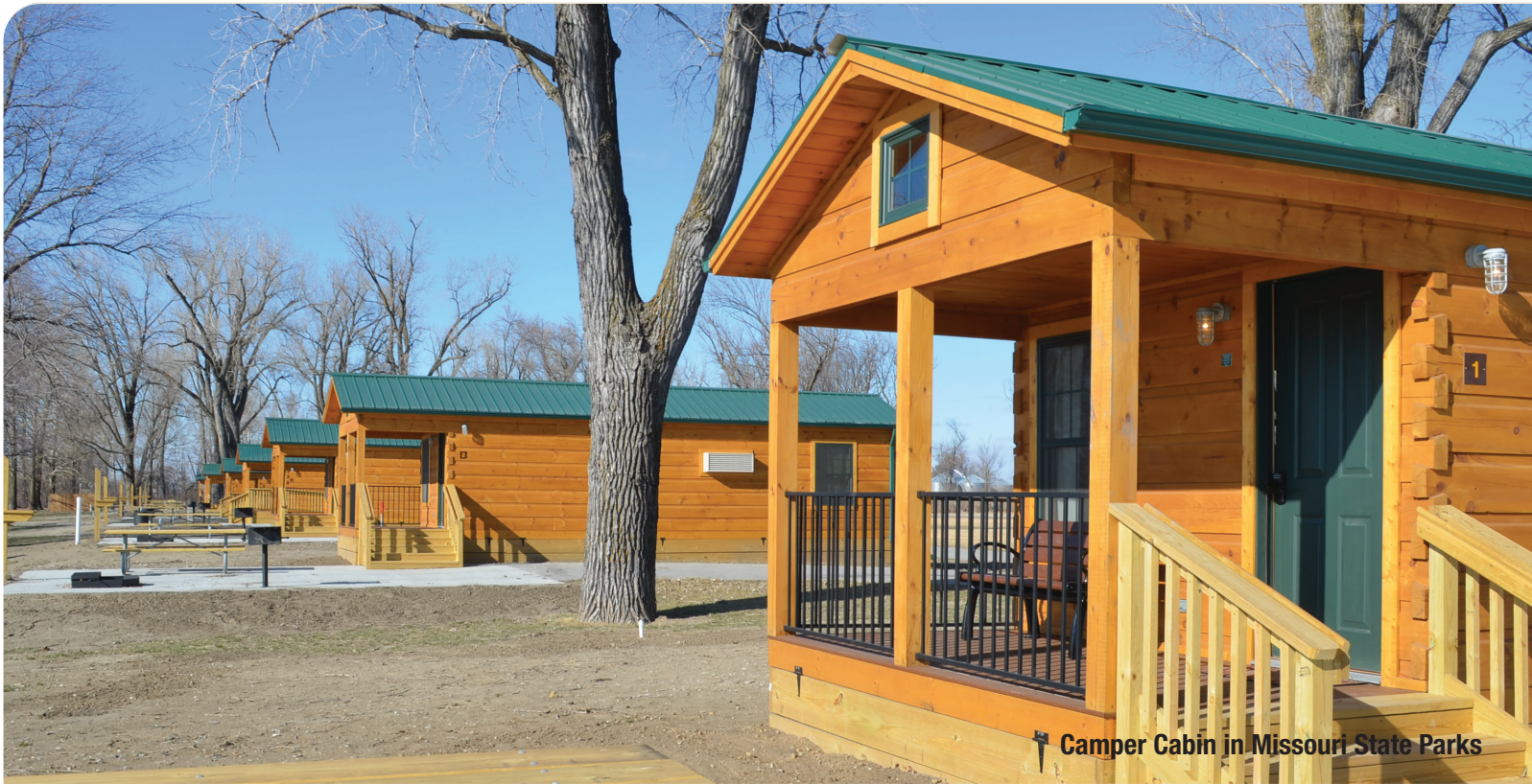
Camper Cabin in Missouri State Parks