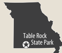
Table Rock State Park CAMPGROUND UPGRADE PROJECT

Table Rock State Park features one of the most popular campgrounds in the state park system (See Example A). The park features several sewer/electric/water campsites and they are the most popular sites in the park. The park is experiencing more demand for sewer/electric/water campsites. The proposed project involves completely removing 22 campsites where only electricity is available, and replacing those with 22 newly constructed sites offering 50-amp electric service, sewer and water connections. A campsite's life is typically 40 years.