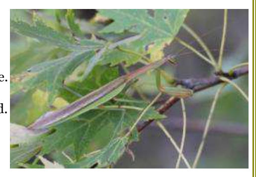
Adult mantis photos from MDC

Chinese mantis were accidently brought in to the Northeastern