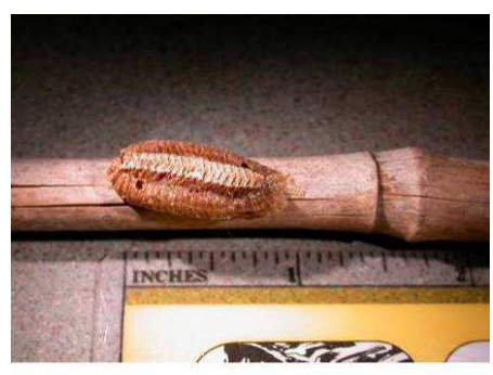
Carolina mantis egg case

The Carolina mantis feeds on small insects like flies, bees, beetles, and many others. They depend on their stealth and camouflage. Insects are even known to land on them their camouflage is so great!