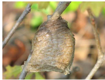
US in 1896 and have spread since. They prey upon many insects and the occasional hummingbird. They also prey upon Monarch butterflies.

Jerry Decker correctly identified this as an egg mass from a praying mantis. Specifically, it is the Chinese mantis. They have a prominent green stripe down their side and grow to be 5" long where our native Carolina mantis is about 2.5" long. Females are larger than males. The females are known to eat the male during mating about 25 percent of the time!