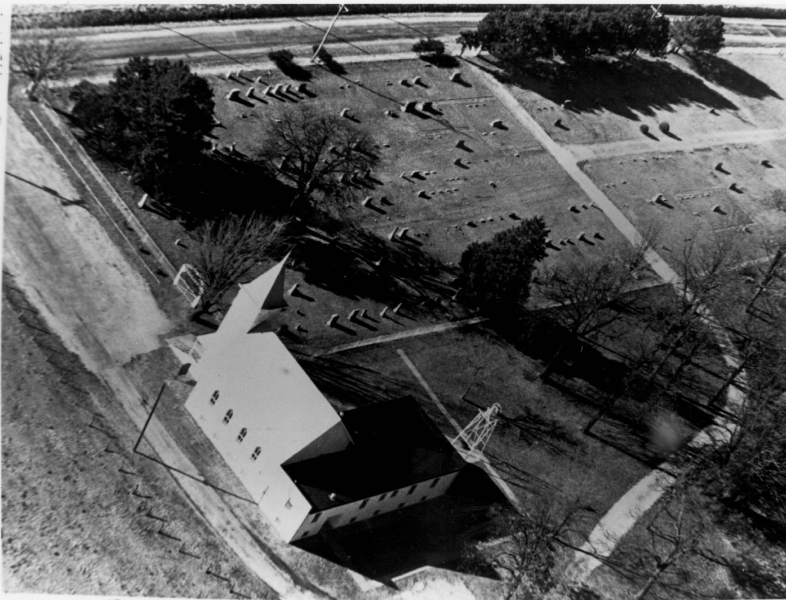
EAST FRISCO RAILROAD TRAVIS