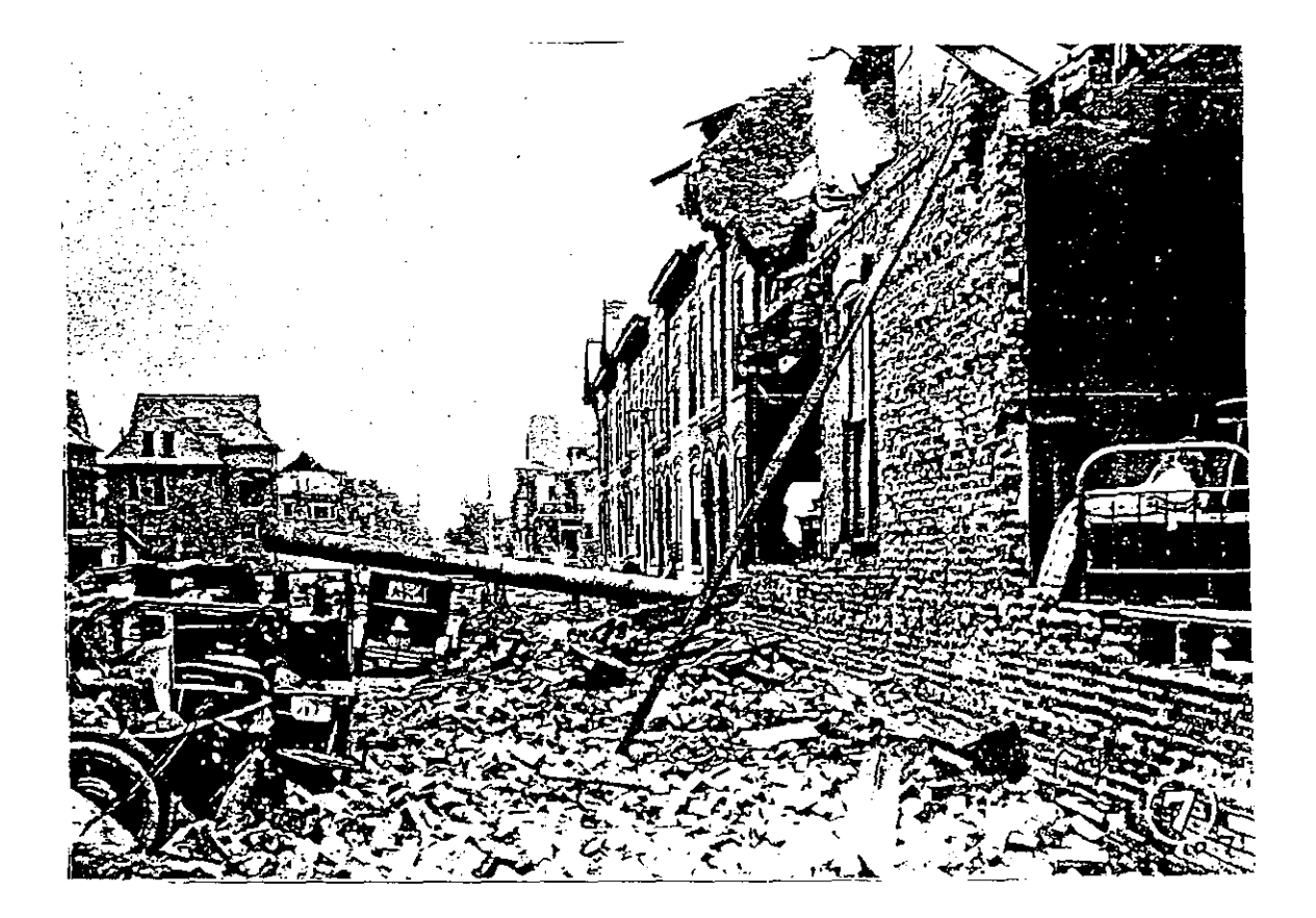
Photo showing damage from tornado, September 29, 1927; N. Boyle Avenue, looking north from Laclede.