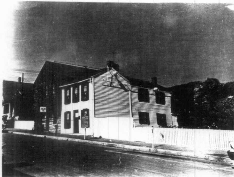
Mark Twain's Museum and Home, located at 206-208 Hill Street, Hannibal. The two story white frame house, was the famed Tom Sawyer house. It was built by John Marshall Clemens, Mark Twain's father in 1844. It was the scene of many of the incidents in the "Adventures of Tom Sawyer." Tom Sawyer's real name was Samuel Langhorne Clemens. The stone structure which now serves as a museum was built in 1935. Camera pointing to the north-northwest.