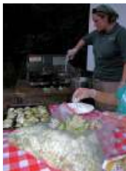
Queen Anne's Lace fritters are on the menu again this summer.

From glade restoration to flooding, the staff at St. Francois State Park have seen a busy spring. In early may, 180 scouts from the St. Louis Area Boy Scout Council joined Missouri State Park staff for a day of service in the park. Scouts spent the entire day on Saturday, May 7 to help park staff clear and mark all the park's trails, reroute portions of the Pike Run trail, and aid with restoration of two of the park's glades. The scouts and the scout leaders together donated over 1,200 hours of service to the park. Their efforts were very much appreciated, and helped park staff work on many projects that we simply couldn't do without help!