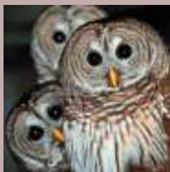
Barred Owl ( Strix varia )

A familiar nighttime sound while you are camping in a Missouri State Park, the call of the barred owl is a camper favorite.