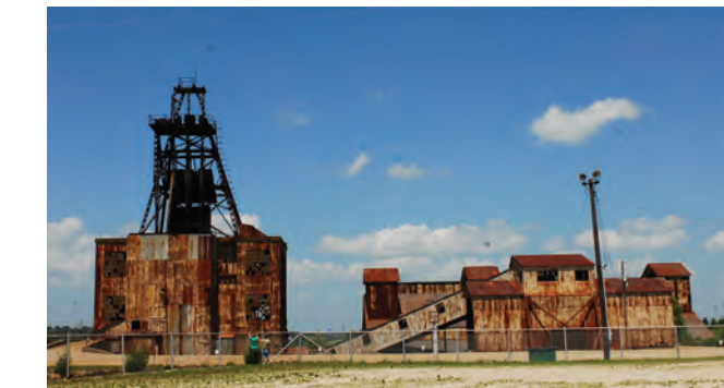
Missouri Mines State Historic Site