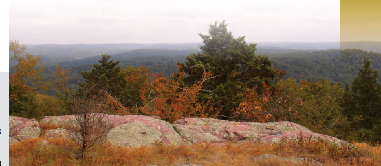
Johnson's Shut-Ins State Park