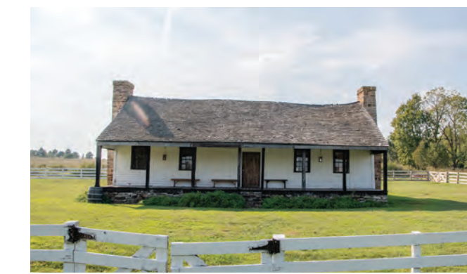
Nathan and Olive Boone Homestead State Historic Site