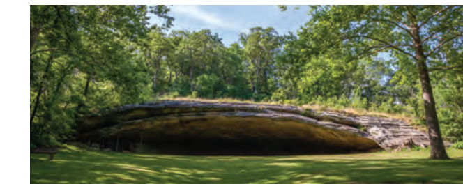
Graham Cave State Park