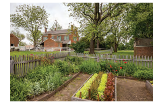
Watkins Woolen Mill State Historic Site

History is all around you at Missouri state parks, and each state park and state historic site has its own unique stories to tell. Visitors are encouraged to learn about the state's fascinating past as they tour the historic homes of famous Missourians, explore the settlements of early French and German immigrants, wander across somber Civil War battlefields, appreciate the enduring rustic architecture of the Civilian Conservation Corps, stroll across the landscape of an American Indian village, or learn about the many contributions of Missouri's Black Americans. Missouri State Parks preserves and interprets numerous examples of the state's most outstanding cultural landmarks, including buildings, structures and archaeological sites, many of which are recognized nationally for their historical significance. The Missouri State Parks system contains close to 240 properties listed on the National Register of Historic Places, either listed individually or as contributing features to one of 19 NRHP-listed historic districts, and boasts seven National Historic Landmarks.