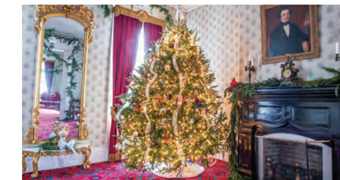
Hunter-Dawson State Historic Site