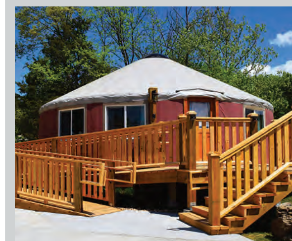
Table Rock State Park

Enroll in the Customer Rewards Program at a Missouri State Parks location or when speaking with the call center team, or update your online customer account at icampmo.com and visit mostateparks.com for more information.