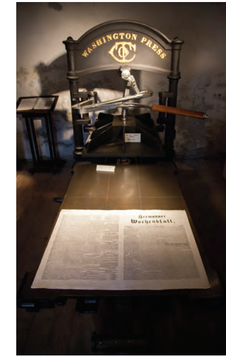
Deuschheim State Historic Site

DISCLAIMER: This map is not a legal survey. The Missouri Department of Natural Resources makes no warranty, expressed or implied, as to the accuracy of the data or related materials and is not responsible for any damage or loss resulting from its use.