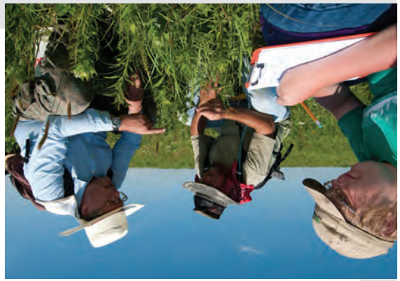
Left: collection of data at Pointe State Park. Above: preserved at Thomas Hart Benton Home and Studio State Historic Site

To protect the state's most exceptional resources, to provide opportunities for the people of Missouri to enjoy them, [and] to encourage one-of-a-kind recreational values and animals may long exemplify ecological values and native plants and animals that are protected, restored and managed to assure their scenic character.