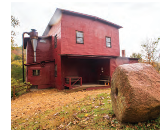
Dillard Mill State Historic Site