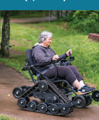
Elephant Rocks State Park

When making reservations, there are various options for payment, including credit cards, debit cards, camping coupons and gift cards. Check mostateparks.com for more information about camping reservations and payment requirements.