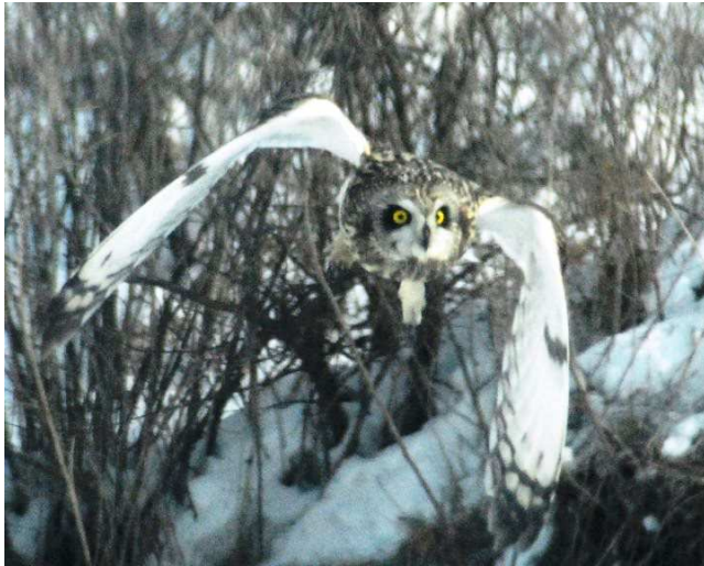
Look at the intensity of the eyes! This is a photo from 2011 taken here in the park. The eyes say it all.

This one was out during the day and the staff was lucky enough to get this picture.