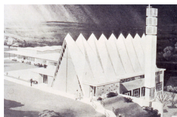
Christ the King United Church of Christ in Black Jack by Manske & Dieckmann, 1960.

Prows are another architectural element, often incorporating a repeated pattern of small stained or colored glass windows set in brick.