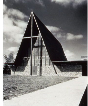
Lutheran Church of the Atonement in Florissant, MO by Harris Armstrong, 1949.

Construction of the A-frame, also called a tent form church, became popular in the 1950s. The origins of the A-frame can be seen in medieval villages of northern Europe, in homes and other buildings with steeply pitched rooflines. Wide spread use of the A-frame added to its popularity, as well as its accessibility and affordability. The A-frame allowed for volume and height that traditional church structures were known for, while keeping pace with styles of the modern architectural field. In 1955, architect Paul Thiry expressed his appreciation for the A-frame: "Isn't all this exactly what the church builder has been looking for all the ages past – greater span, height, lightness, openness, acoustical control, ease of construction, simple methods?" (Randl 2004, p 127). The 1954 issue of Architectural Forum published the design of Eero Saarinen (architect of the St. Louis Gateway Arch, 1948-64) for Concordia College Chapel (Kramer Chapel) in Fort Wayne, Indiana ("The Tent Form..." 1958). Kramer Chapel is regarded as one of the first examples of the A-frame church in the United States and became a model for many congregations. Saarinen, however, was not the only architect successfully applying the A-frame style to church designs. Published in the very same issue of Architectural Forum was Harris Armstrong's design for the Lutheran Church of the Atonement in Florissant, which is now, unfortunately, demolished.