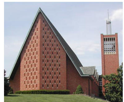
St. Peter's United Church of Christ in Ferguson by Manske & Dieckmann, 1958.

Prows are another architectural element, often incorporating a repeated pattern of small stained or colored glass windows set in brick.