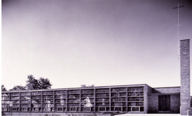
Faith-Salem Evangelical and Reformed Church of Jennings, now Brotherly Love West Christian Assembly, represents the simple box-shape, flat-roof design of modern architecture. Designed by Frederick Dunn & Associates, 1955.