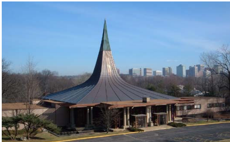
The Ethical Society of St. Louis. Designed by Harris Armstrong, 1961.

deeply inset stained glass windows. The exterior of Harris Armstrong's 1961 design of the Ethical Society of St. Louis in Ladue reflects the slightly oriental qualities made popular by Edward Durrell Stone and Minoru Yamasaki at that time. Typical of Armstrong's interest in technology, the reflecting pools near the entrance also served as the air-conditioning system. The Priory Chapel (1962) in Creve Coeur garnered designers Hellmuth, Obata & Kassabaum (HOK) numerous accolades and international attention. The church consists of two concentric levels of thin concrete parabolic arches. Obata's