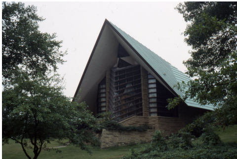
Frank Lloyd Wright's Unitarian Meeting House in Shorewood Hills, Wisconsin, 1946.

Modifications to the A-frame design can vary greatly and are as commonly found in mid-century architecture as traditional A-frames themselves. Frank Lloyd Wright's Unitarian Meeting House in Shorewood Hills, Wisconsin is perhaps the most famous. Commissioned in 1946, Wright designed a structure with a steeply gabled roof, similar to an A-frame. It differs in that the sanctuary entry has a low ceiling and gently slopes upward towards the rostrum and peaks at a glass-filled prow. These irregularly shaped rooflines, with an emphasis on irregularly shaped rooflines, can be found throughout St. Louis County.