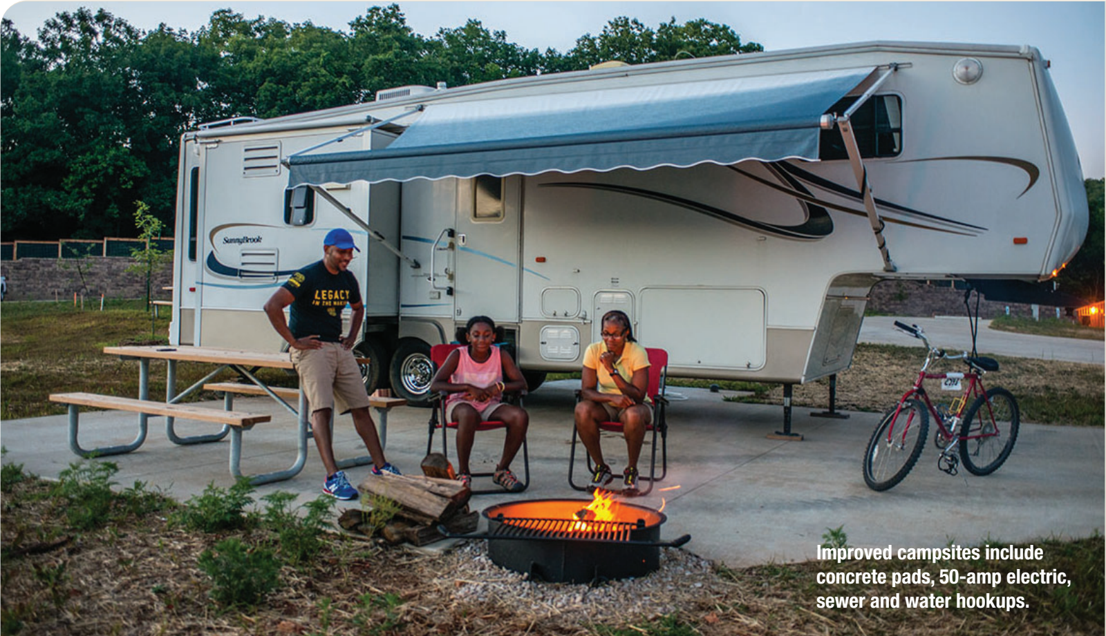
Improved campsites include concrete pads, 50-amp electric, sewer and water hookups.