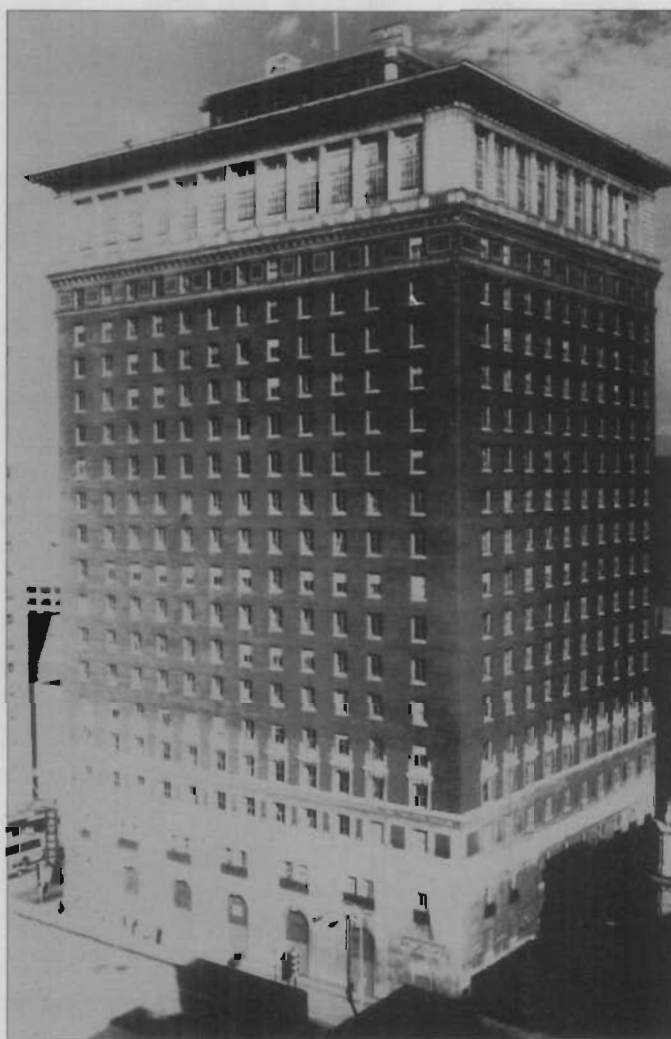
The Hotel Statler (1917) is listed in the National Register of Historic Places as a significant example of the innovative designs of George B. Post & Sons, the New York firm that set the standard for modern hotel design. Although currently vacant and threatened by possible sale for demolition and new construction, the Statler appears to be in good condition and remains highly intact.

more milled about in the hallways or turned back when they were unable to gain admission. The St. Louis Republic described the room's appearance at this session: "Patriotic bunting and flags entwined gracefully with festooned pennants of the suffrage yellow. Pots of narcissi, the suffrage flower, formed a vivid