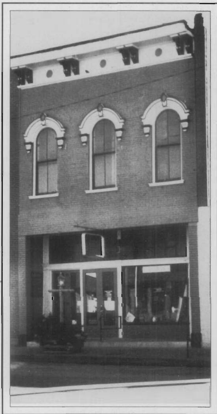
The best-preserved building in Sedalia's once "notorious red light district," 217 West Main was recently listed in the National Register for its significance to the area's social history.

neighborhood on Sixth Street, in Happy Hollow, and on Washington Street just north of the railroad tracks. By the turn of the century, however, Sedalia's red-light district had coalesced in the "dives" along West Main Street where at least eight brothels operated in a two-block section. The typical brothel was on the second floor of a legitimate business — a saloon, a store or a restaurant. A series of small