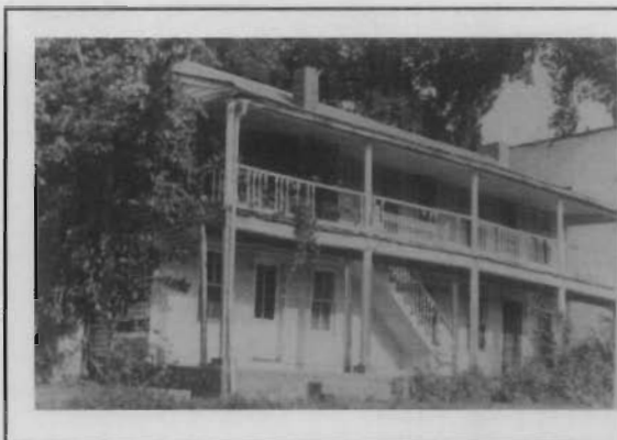
The Old Stagecoach Stop had been abandoned and vacant for 20 years when it was purchased by the foundation in 1983.