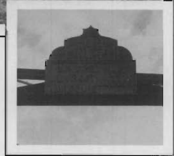
The Cox Ford Bridge, three and one-half miles east of Kingston, crossing Shoal creek, was built in 1888 by the King Iron Bridge Company, Cleveland, Ohio.