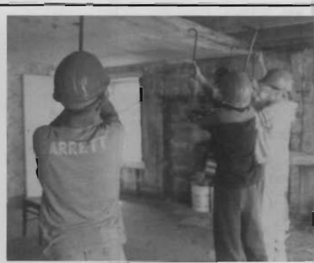
Three LEAP students remove a 1950s-vintage ceiling to expose original rough-sawn joists of the 1850s log cabin.