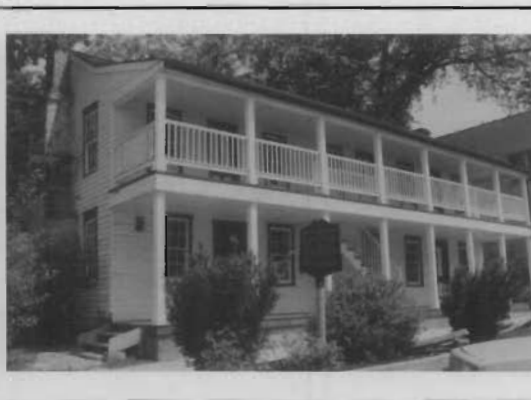
The exterior stabilization and painting was partially funded by a Historic Preservation Fund Grant.

Society in St. Louis, the State Historical Society of Missouri and the Western Historical Manuscript Collection in Columbia; and even the National Archives in Washington, DC.