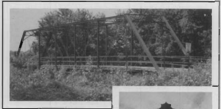
Shoal Creek Bridge, approximately three miles northwest of Kingston, was built in 1888 by John Dildine and Company, Cameron, Missouri.

The Pratt truss (examples below) is the most common of bridge trusses in Missouri and, in the 19th and early 20th centuries, it was the most common in the United States. The through-truss version was used for medium spans, and the pony-truss version was used for short spans. In Missouri, these were built until the 1940s. Their construction in most of the country stopped at ca. 1920.