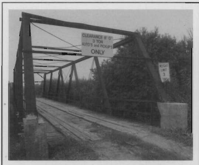
Mud Creek Bridge, two miles northeast of Braymer, 1887, King Iron Bridge Company, Cleveland, Ohio.