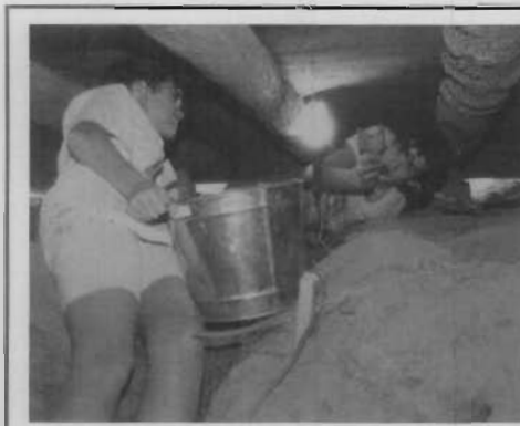
A LEAP student holds up a broken glass goblet found under the building during the salvage excavation.

Jan Primas teaches grades 3–5, and Terry Primas teaches grades 6–8 in Waynesville R-VI Schools' LEAP, 339 School St., Waynesville, MO 65583.