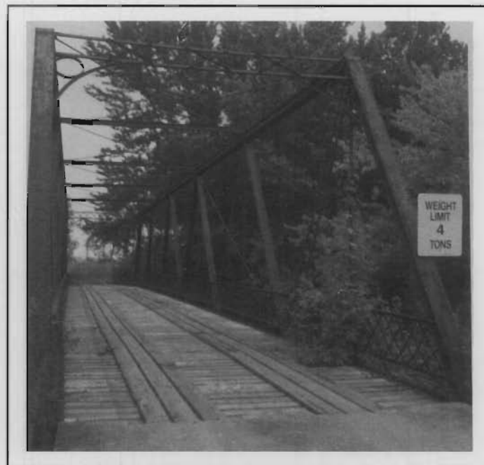
Henkins Ford Bridge, two miles north of Catawba, 1887, King Iron Bridge Company, Cleveland, Ohio.