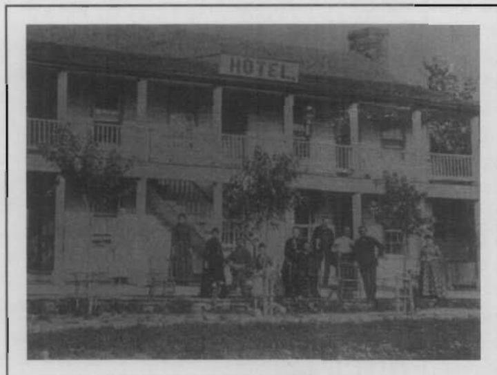
The Old Stagecoach Stop was being operated as a hotel when this photo was taken by an unknown photographer in 1900.

In what may be Missouri's most innovative museum/school partnership, the Old Stagecoach Stop in Waynesville becomes a learning laboratory for a multi-disciplinary educational program.