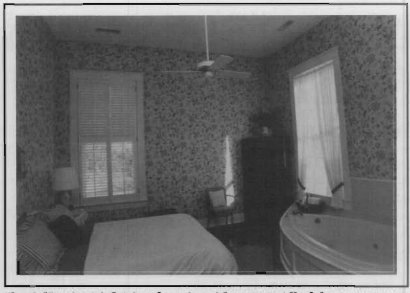
The "bridal" suite (right) is a favorite with guests. All of the guest rooms are furnished with antiques in a variety of styles. The view from a first floor guest room (left) includes a ca 1861 Greek Revival church.

"Our location in Rocheport has allows us to offer guests a whole vacation package that other B&Bs can't match." Vicki Ott