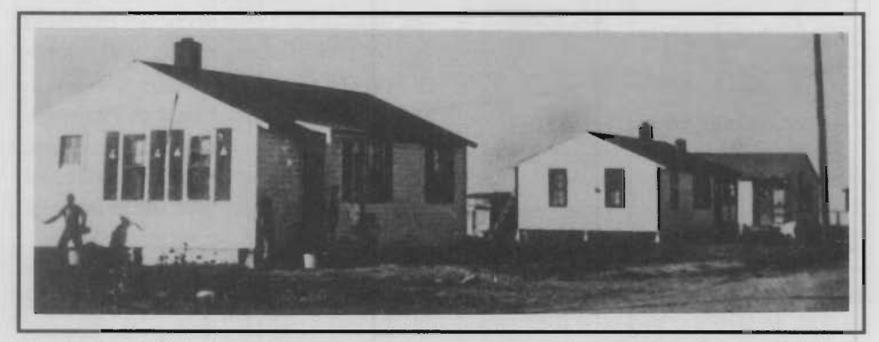
The Delmo Farm Labor Homes were bought by residents at $800 each. Payments of $10.20 per month began in January 1948; all payments were completed in 1954.

Construction on the Delmo Project houses began in 1940 and was completed in 1941. A total of 595 houses were constructed, with 30 to 80 houses