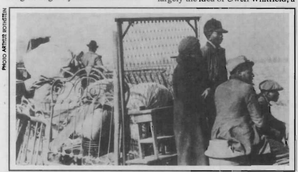
"Here our possessions lie." Evicted sharecroppers' roadside demonstration, January 1939.