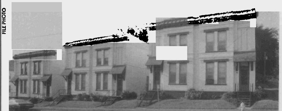
Museum Hill Historic District