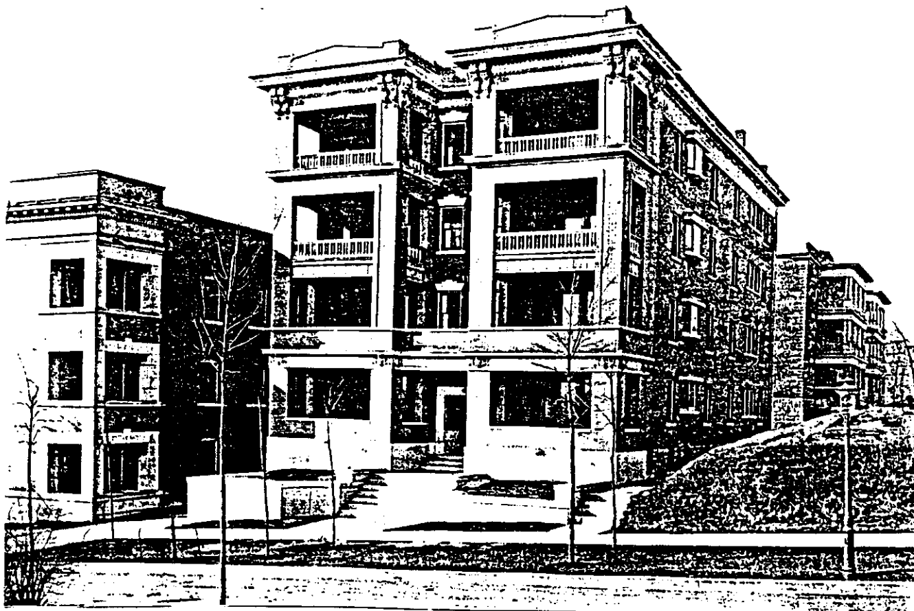
THE NEW ENGLAND APARTMENT HOUSE, KANSAS CITY, MO. EDWARDS & SUNDERLAND, ARCHITECTS.