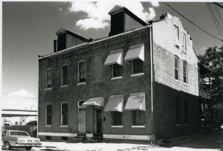
50 NORTH BROADWAY INDUSTRIAL SURVEY II 812-14 WRIGHT FACING SE