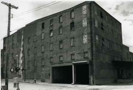
#9 NORTH BROADWAY INDUSTRIAL SURVEY II N CLINTON FACING NW