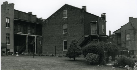
NORTH BROADWAY INDUSTRIAL SURVEY II 3316 REAR NORTH NINTH FACING N-NW