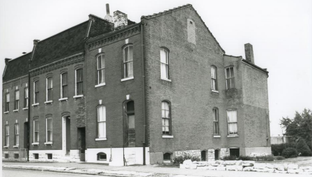
NORTH BROADWAY INDUSTRIAL SURVEY II 2314 N. NINTH (RIGHT) PACING NE