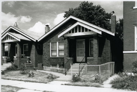
#127 NORTH BROADWAY INDUSTRIAL SURVEY II 4006 N. NINTH FACING NE