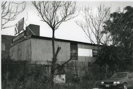
#117 NORTH BROADWAY INDUSTRIAL SURVEY II 3804 N. NINTH FACING NE