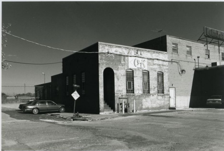
156 NORTH BROADWAY INDUSTRIAL SURVEY II 4138 N. SECOND FACING SE