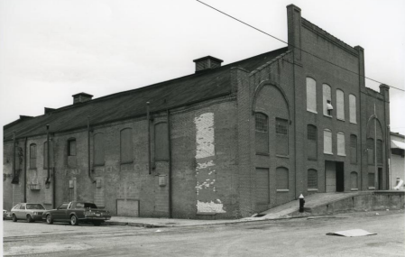
#10 NORTH BROADWAY INDUSTRIAL SURVEY II 2234 N. SECOND FACING SE