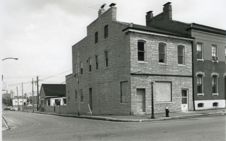
#100 NORTH BROADWAY INDUSTRIAL SURVEY II 832.8 N. NINTH FACING SE