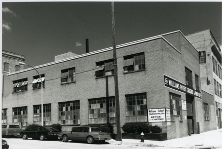
#45 NORTH BROADWAY INDUSTRIAL SURVEY II 2701 N. BROADWAY PACIFIC NW