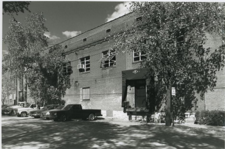
#145 NORTH BROADWAY INDUSTRIAL SURVEY II 4044 N. FIRST FACING NE