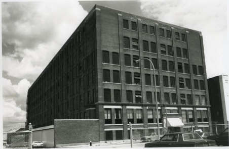
#5 NORTH BROADWAY INDUSTRIAL SURVEY II 2212-20 N. BROADWAY FACING SE