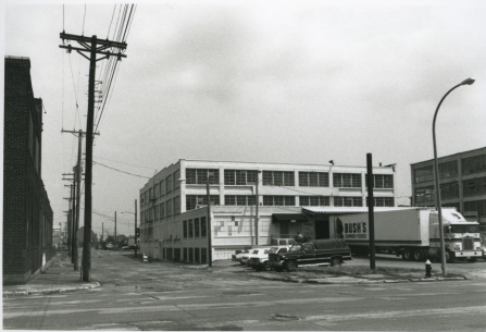
81 NORTH BROADWAY INDUSTRIAL SURVEY II 210 BUCHANAN FACING SE