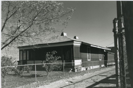
#159 NORTH BROADWAY INDUSTRIAL SURVEY II 210-12 FERRY FACING SE