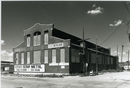
# 77 NORTH BROADWAY INDUSTRIAL SURVEY II 300 N. BROADWAY FACING NE