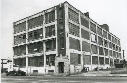
# 80 NORTH BROADWAY INDUSTRIAL SURVEY II 3228 N. BROADWAY FACING NE