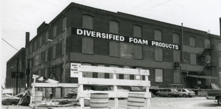
#56 NORTH BROADWAY INDUSTRIAL SURVEY II 3014 N. 2ND FACING NE