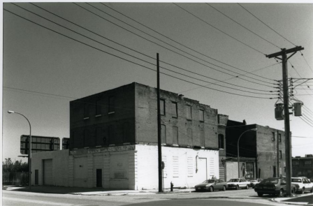
#47 NORTH BROADWAY INDUSTRIAL SURVEY II 8700-04 N. BROADWAY FACING NE