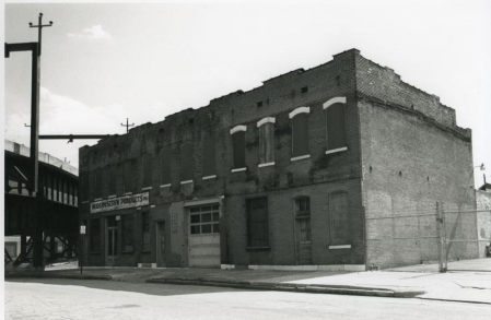
#2 NORTH BROADWAY INDUSTRIAL SURVEY II 2307-11 N. 9th FACING SW