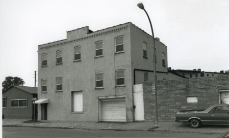
#67 NORTH BROADWAY INDUSTRIAL SURVEY II 3105-07 N. NINTH FACING W-SW