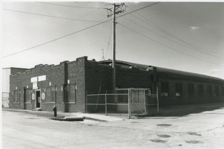
# 166 NORTH BROADWAY INDUSTRIAL SURVEY II 105 FERRY FACING NW