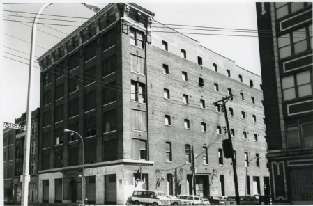
# 32 NORTH BROADWAY INDUSTRIAL SURVEY II 2604-06 N. BROADWAY FACING NE