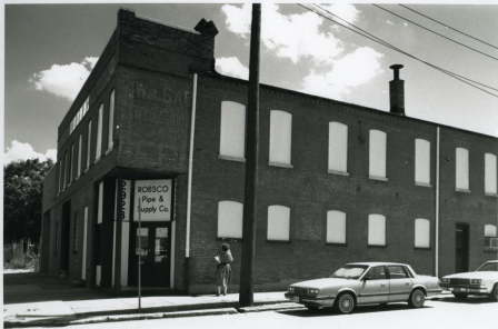
#53 NORTH BROADWAY INDUSTRIAL SURVEY II 2917-23 N. BROADWAY FACING SW