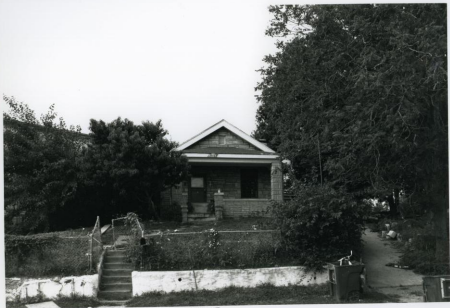
#61 NORTH BROADWAY INDUSTRIAL SURVEY II 3115 N. ELEVENTH FACING W