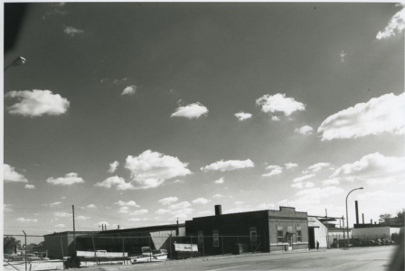
* 140 NORTH BROADWAY INDUSTRIAL SURVEY II 4006 N. BROADWAY FACING SE