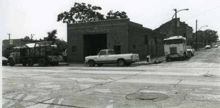
#76 NORTH BROADWAY INDUSTRIAL SURVEY II 3237 N. BROADWAY FACING SW