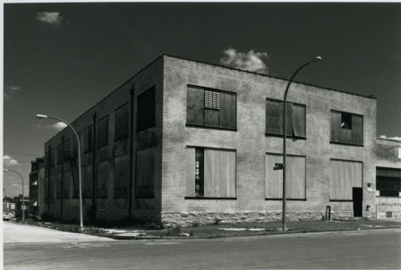
#49 NORTH BROADWAY INDUSTRIAL SURVEY II 2820 N. NINTH FACING SE