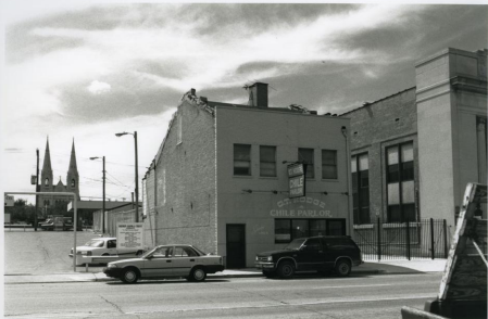
# III NORTH BROADWAY INDUSTRIAL SURVEY II 3523 N. BROADWAY FACING W-NW