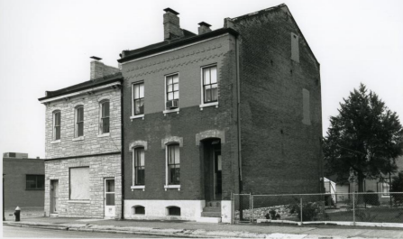
# 99 NORTH BROADWAY INDUSTRIAL SURVEY II 3324 N. NINTH (RIGHT) FACIN S NE