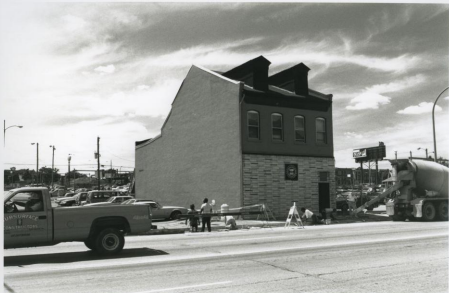
#114 NORTH BROADWAY INDUSTRIAL SURVEY II 3607 N. BROADWAY FACING NW