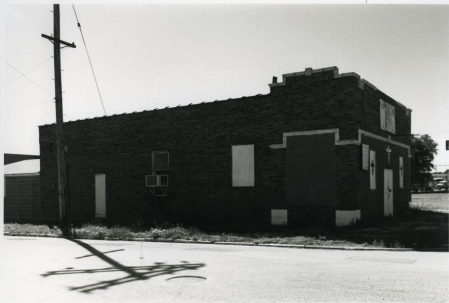
417 NORTH BROADWAY INDUSTRIAL SURVEY II 2524 N. 10 th FACING SE