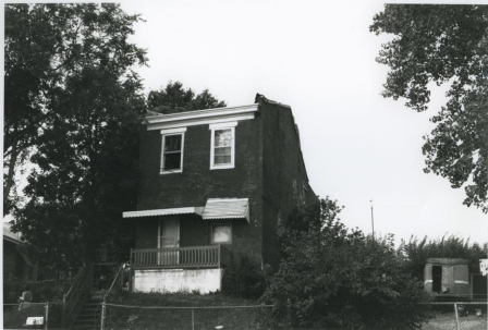
#62 NORTH BROADWAY INDUSTRIAL SHADY II 3119 N. ELEVENTH FACING W