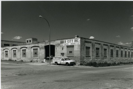
#48 NORTH BROADWAY INDUSTRIAL ENTRY II 2820 N. NINTH FACING NE