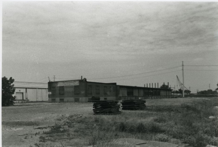
# 89 NORTH BROADWAY INDUSTRIAL SURVEY II 3150 HALL FACING NE