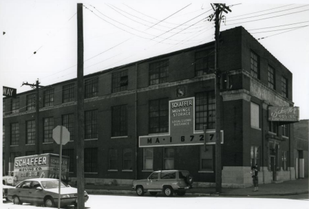
8 16 NORTH BROADWAY INDUSTRIAL SURVEY II 2422-24 N. BROADWAY PACINA SE