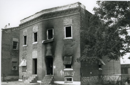
#71 NORTH BROADWAY INDUSTRIAL SURVEY II 3156-58 N. ELEVENTH FACING NE