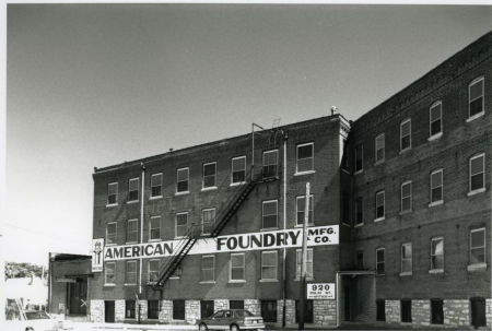
NORTH BROADWAY INDUSTRIAL SURVEY II N6-30 PALM FACING SE