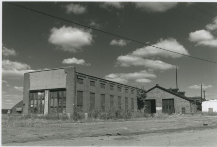
#148 NORTH BROADWAY INDUSTRIAL SURVEY II 37 BREMEN FACING NE