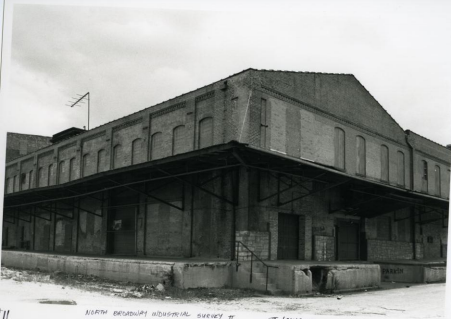
11 NORTH BROADWAY INDUSTRIAL SURVEY II 2217 N. FIRST FACING SW