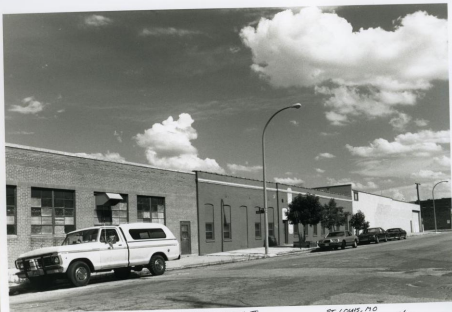
#3 NORTH BROADWAY INDUSTRIAL SURVEY II 2214-24 N. 9th FACING SE