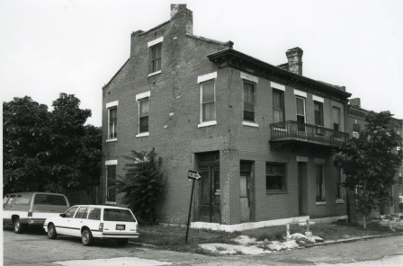
#121 NORTH BROADWAY INDUSTRIAL SURVEY II 891-33 BALEMEN FACING NE