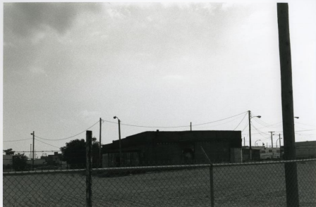
#75 NORTH BROADWAY INDUSTRIAL SURVEY II 3116-18 N. NINTH FACING SE