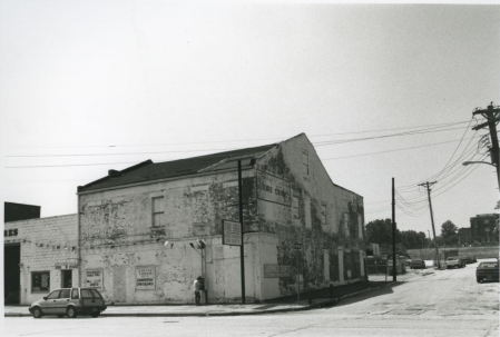
#116 NORTH BROADWAY INDUSTRIAL SURVEY II 3749 N. BROADWAY FACING W-SW