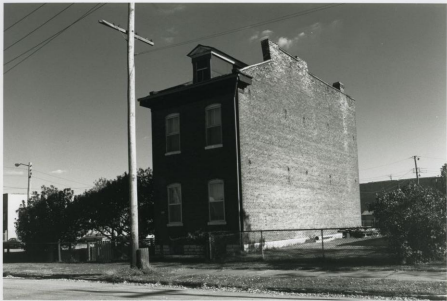
#160 NORTH BROADWAY INDUSTRIAL SURVEY II 206 FERRY FACING SE