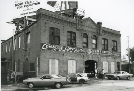
NORTH BROADWAY INDUSTRIAL SURVEY II 3810-14 N. NINTH FACING SE