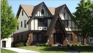
525 E. Arrow St. – McKinney Home c. 1920

“The socio-economic relationships of Old Town and East Wood have been constant for over a century. In the mid-19th century developers platted narrow and deep lots near the town's square for sale to and occupancy by Marshall's professional merchant class. Odell Street was a part of this town planning, but 20th century commercial expansion has destroyed all but minimal vestiges of the historic suburban neighborhood. East Woods, however, retains numerous town lots 500' to 1500' deep and picturesque settings among tree lined streets.” FROM - http://dnr.mo.gov/shpo/survey-eg.htm