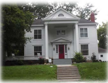
334 E. North St.