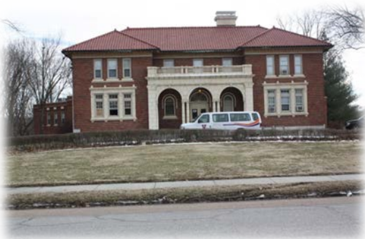
1044 E. Eastwood St. – Blosser Home for Crippled Children