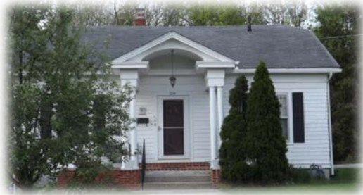
320 E. Eastwood (one of the few one-story examples)