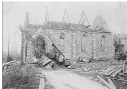
Above is the Lafayette Square’s Unitarian Church of the Unity before and after a destructive 1890s tornado. 25