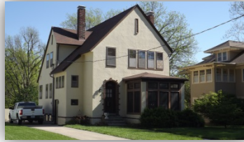
525 E. Arrow St. – McKinney Home c. 1920