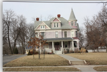
423 E. North St. – 1881