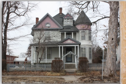
305 E. Arrow St. – 1876

From the 1880s and into the early 1900s, the most prolific of the post-Civil War Victorian period styles found in Marshall is Queen Anne. Every street within the Survey District has several variations of it, which include the Spindle Work, Free Classic, Half-Timbered, and the Patterned Masonry forms. A majority of these homes are two and two-and-one-half-story homes, but a few are one and one-and-half-story.