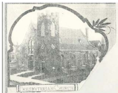
Marshall’s Rock Presbyterian Church, c. 1910.