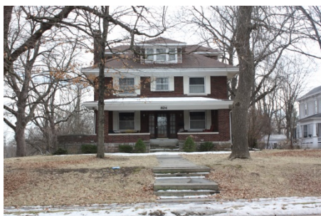
824 E. Eastwood St. - 1919

Marshall's greatest building boom occurred in the early 1900s, from the late 1890s to the 1920s. The most popular architectural style of period was the Prairie and Craftsman house and its American bungalow or cottage form.