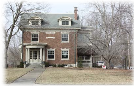
345 E. North St.

Marshall's greatest building boom occurred in the early 1900s, from the late 1890s to the 1920s. The most popular architectural style of period was the Prairie and Craftsman house and its American bungalow or cottage form.