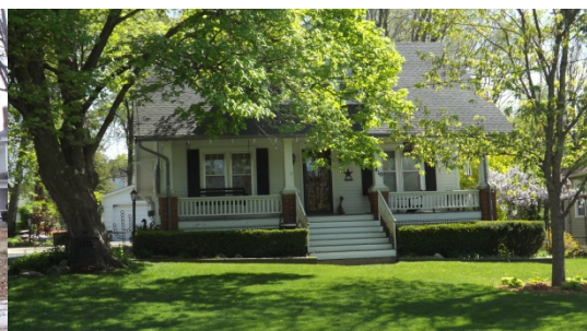
410 E. Eastwood St. - Bungalow c. 1910

As Marshall's middle class grew, they sought to claim the great American Dream of owning their own home. The Prairie and Craftsman design was popular with them for its simplicity, affordability, and efficient use of space with low pitched roof lines and overhanging eaves from the English-based Arts and Crafts Movement.