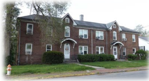
340 E. Eastwood, Steele Apartment's built c. 1920

Also, during this period where affordable and low cost housing was in demand, several superior examples of urban apartment design were built. These apartment buildings include: 340 E. Eastwood, Steele Apartment's built c. 1920; 305 E. North, built in 1925 as Groschell Apartment Building; and 25 S. Brunswick, built c. 1930, as the Wells Apartments.