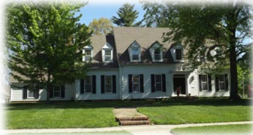
531 E. Eastwood (Van Dyke, c. 1958 and last of the monumental)

The district also includes several distinct and monumental Neoclassical and Colonial Revival houses, exhibiting dramatic colonnaded front entrances and classic detailing. Inspired by the Georgian, Adam, Early Classical Revival and Greek revival traditions these homes built between c. 1900 and 1940 still retain a commanding presence. Include: 334 E. North Street, 345 E. North Street, 407 E. North, 334 E. Arrow, 421 E. Arrow, 610 E. Arrow, 116 N. Brunswick, 125 N. Brunswick (Buckner), 320 E. Eastwood (one of the few one-story examples), 526 E. Eastwood (Cooney), 531 E. Eastwood (Van Dyke, c. 1958 and last of the monumental), 741 E. Eastwood, 760 E. Eastwood, 836 E. Eastwood (Blosser for Women)