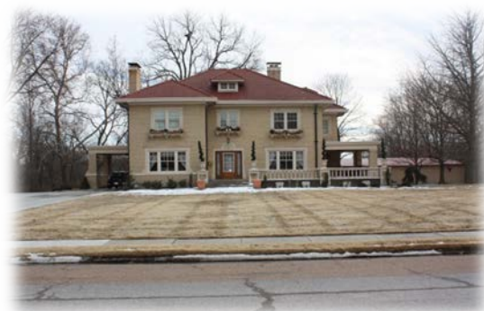
1124 E. Eastwood St.