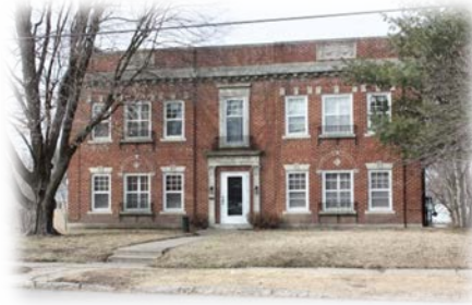
305 E. North, built in 1925 as Groschell Apartment Building

Steele was a carpenter and also built the three bungalows east of the Bergman house. He lived in one of them while constructing this apartment building. Steele also held a public office at one time. The low area around Grimes house, Steele Apartments, and the Bergman's was once the city dump, upon in the center which the Steele's building stands. The four brick apartment complexes were the only ones in town until c. 1960.