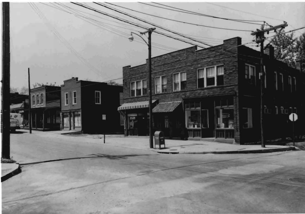
Gebelien's Dry Goods Store, 753 and 755 Marshall Avenue, built 1922. Photograph taken in 1962