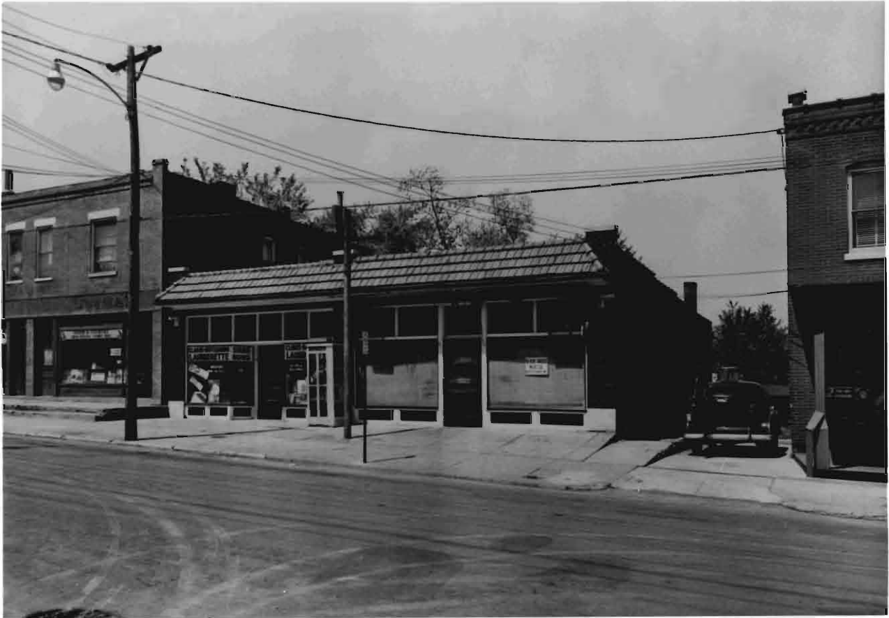
Goldstein's Piggley Wiggley Grocery Store, 741 and 743 Marshall Avenue, built 1927.