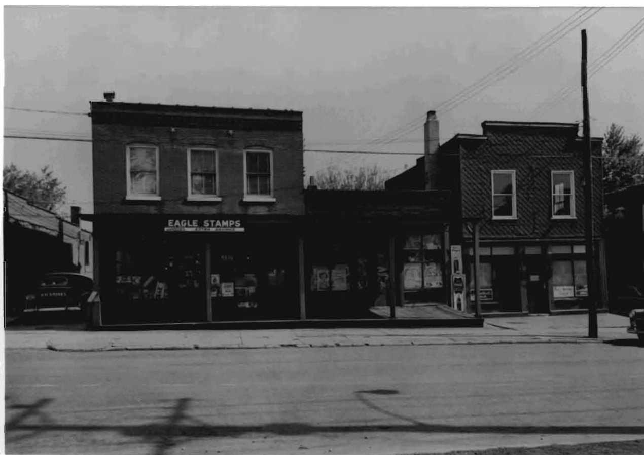
Hughs Grocery (later Hackmann's Groceries and Meats), 745 and 747 Marshall Avenue, built 1905 and Burney's Confectionary, 749 Marshall Avenue, built 1890. Photograph taken 1962

Highlands, but its more important orientation was toward the northeast and Maplewood. Maplewood was a large commercial area and it was close. People from Tuxedo Park rode the Manchester Line to Maplewood to shop or to work more often than they went to the commercial area of Webster Groves. 24 A streetcar stop and shelter at Marshall Avenue and Summit created a strong potential market for convenience stores in Zeta Dell.