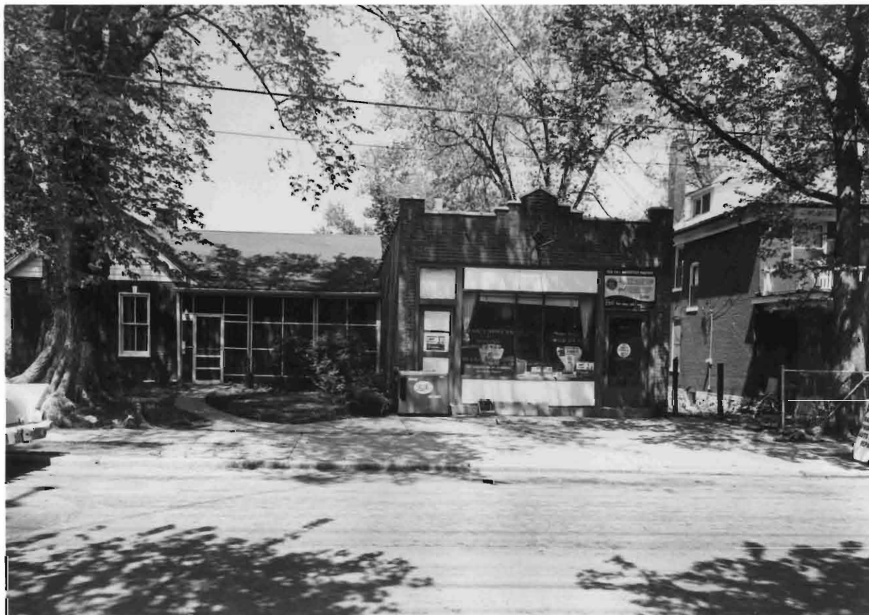
Old Robyn house, 717 Marshall Avenue, built 1909 and Conway's Confectionary, 719 Marshall Avenue, built 1925. Photograph taken 1962.

In 1925 Burdette and Caroline Conway were living in the little Robyn house at 717 Marshall Avenue and they had a small, one-story, brick store added onto the east side of their house - Conway's Confectionary. 39