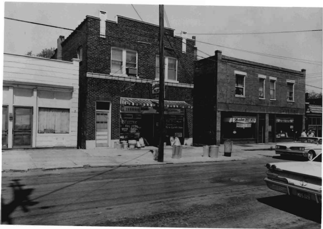
Old Van Hort Drug Store, 733 Marshall Avenue, Graubner Berger Hardware Store, 735 Marshall Avenue, built 1926 for Floyd Wood, and 737 and 739 Marshall Avenue, built 1893. Photograph taken 1962, courtesy Bob Wood.

The Missouri Pacific removed the old Lake Junction Station in 1937, 52 but there was still much foot traffic in the area because the Manchester streetcar was an important commuter facility through World War II. 53 However, around 1950 the streetcars stopped running. 54 The bus company purchased the viaduct over Deer Creek and used it until it became unsafe and was torn down in the 1970's. 55 Automobiles, shopping centers and supermarkets took customers away from these convenient neighborhood stores. Zoning would not permit more stores or parking lots. 56