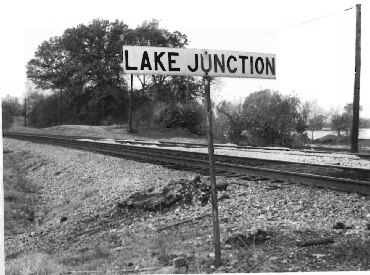
Site of Lake Junction Station at the end of Summit Avenue, today.

ticket on the train. 19 During the 1920's the station was busy enough to require a ticket agent, Charles W. Bonnell. 20 Whether busy or not, the station generated foot traffic on Summit Avenue.