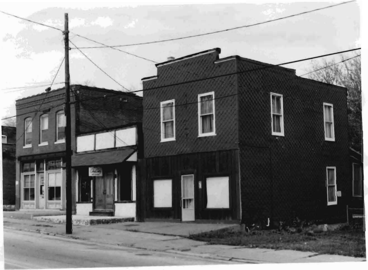
745, 747 and 749 Marshall Avenue today.