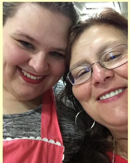
Right photo. Author and daughter at Interpretive training school 2016.