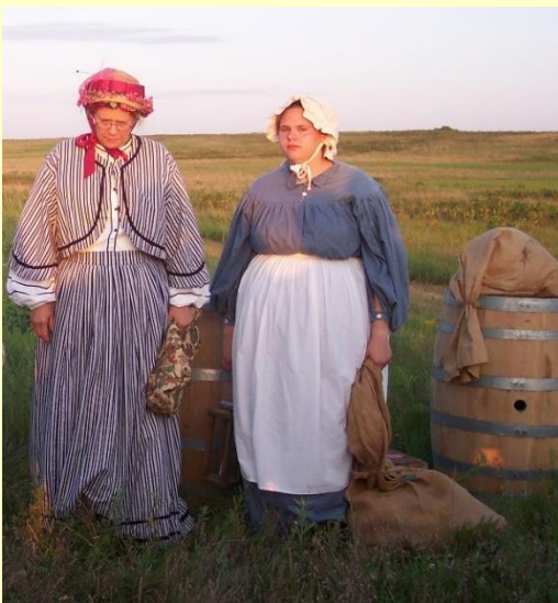
Left photo. Authors’ daughter, on the right, working at a Prairie State Park evening program, The Border Disorder 2005.

Whatever your interests, Missouri State Parks have a lot to offer! And wherever you are at on Stairway to Stewardship, I would like to encourage you to keep moving forward. Check out your local parks and see what they have to offer. Perhaps someday your family will have a legacy of being a Missouri State Park family, too!