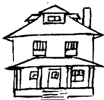
Eclectic American Four-Square

The American Four-Square, a common house type built after the turn of the century also offered comfort and simplicity. Most of the Four-Squares identified during this survey are of frame construction. However, Kirkwood also has brick Four-Squares. The Four-Squares were being built well into the 1920's. Like the Homestead houses they often feature Craftsman or Prairie details, as well as Classical and Tudor elements. They are two story rectangular boxes with medium to low hip roofs, often featuring dormers on at least three of the four sides of the hips. They have prominent full or partial width primary entry porches.