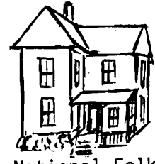
National Folk Square with Pyramidal Roof