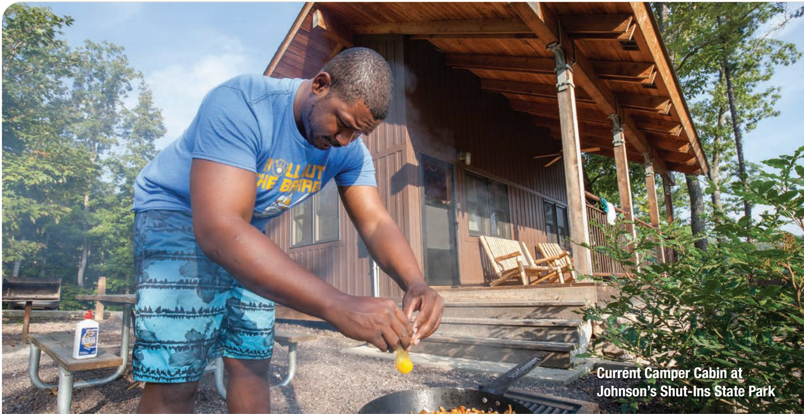
Current Camper Cabin at Johnson's Shut-Ins State Park