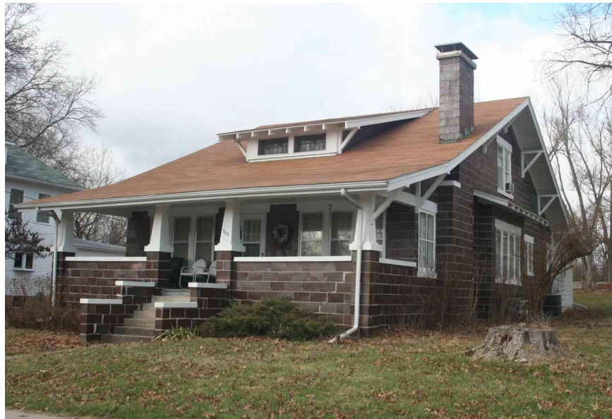
Figure Twelve. Mrs. O. H. Marlowe House, 703 West Davis Street

Bungalows represent the largest group of houses built in the district during Fayette's third period of development. This wholly new American house type began appearing locally around 1915 and remained a popular choice for homebuilders until the late 1930s. Although there are numerous Bungalows in the district, the Marlowe House is somewhat unique. (Figure Twelve) Not only is it a highly intact example of Craftsman styling in Fayette, it is also the only bungalow constructed of concrete blocks. The foundation, walls, porch piers and chimney are all built of reddish-brown concrete blocks. The one and one-half story Marlowe House has a side-facing gable roof over its full-width front porch, and a low-slung shed dormer on its front elevation. Other typical Craftsman features include tapered, square wood porch supports on square masonry piers, double-hung windows with three vertical panes in the upper sash, and wide eaves with triangular brackets.