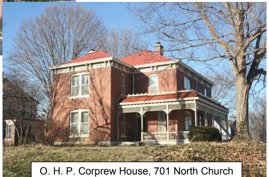
O. H. P. Corprew House, 701 North Church

The Oliver H. P. Corprew House is a later example of Italianate styling in the district. (Figure Four) It is also one of the many houses in the district constructed for professors at Central College. A professor of Greek and Latin, Corprew also led the College as its president for two years. Built in the 1880s at 701 North Church Street, the Corprew House's boxy two-story plan, low-pitched hip roof, arched window openings and wide bracketed cornice are all features of the Italianate substyle of the Victorian architectural movement. The Corprew house also has a wraparound porch with ornate roof cresting and gingerbread detailing--which may have been a later addition, as it is more typical of the Queen Anne substyle.