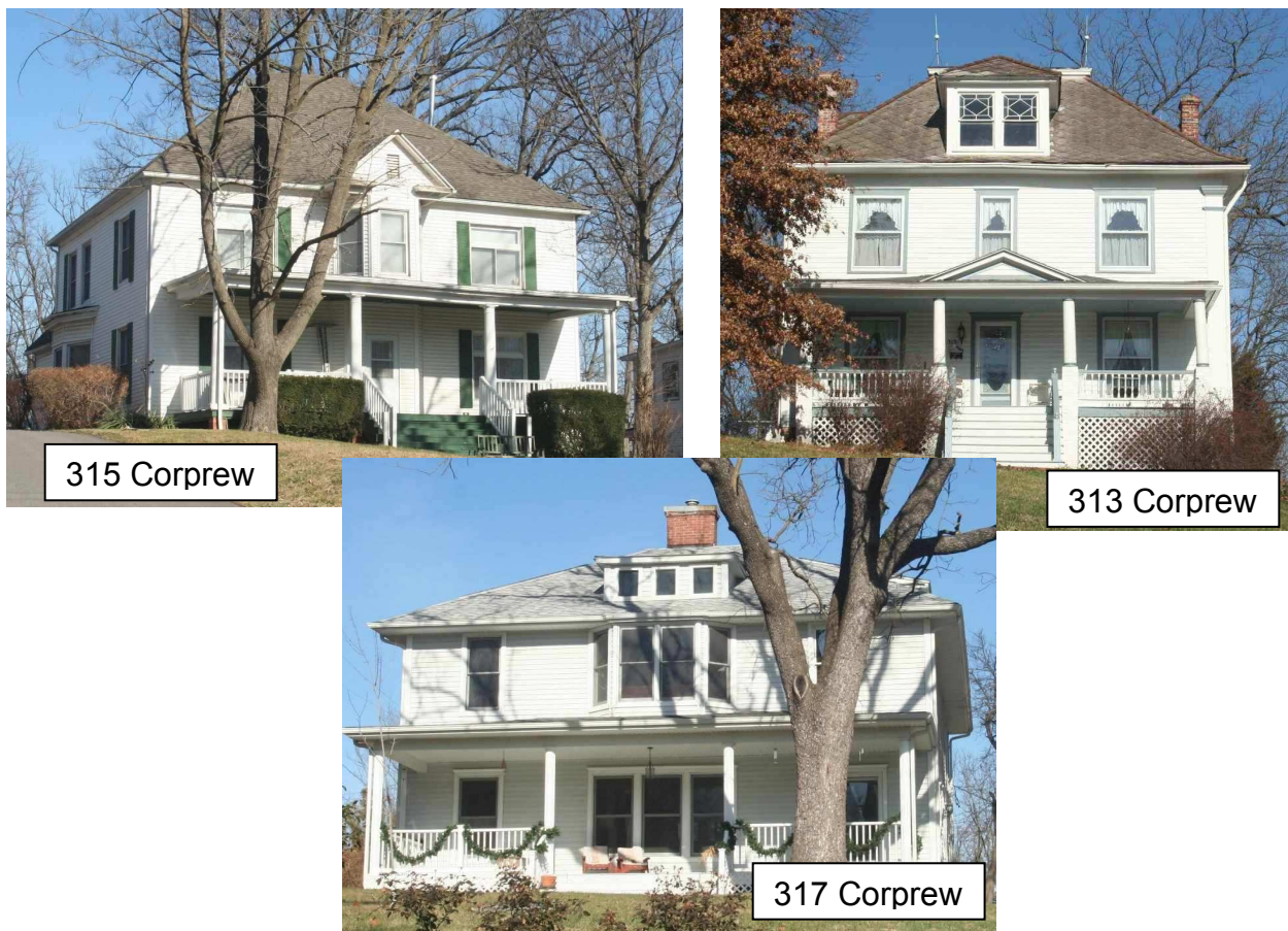
Figure Eleven. Foursquare Houses on Corprew Street

After 1910 or so, Fayette builders followed the national trend toward simpler, modest-sized houses. Houses with simple cubic plans and less ornamentation began filling vacant lots throughout the district. Foursquare houses were the first of the new American house types to appear, and they were built in Fayette from the turn of the 20th century into the late 1920s. Although located throughout the neighborhood, clusters of Foursquare houses can be found on several streets, particularly those that were first developed in the early 20th century. The largest grouping of Foursquare houses is on Corprew Street which was developed around 1900 as part of the College Addition to Fayette. Five of the 15 houses on Corprew Street are Foursquares. (Figure Eleven) Typical of this house type, all five are two and one-half stories tall and have hip roofs. Four of the five have full-width front porches and centrally-placed dormer windows. Only