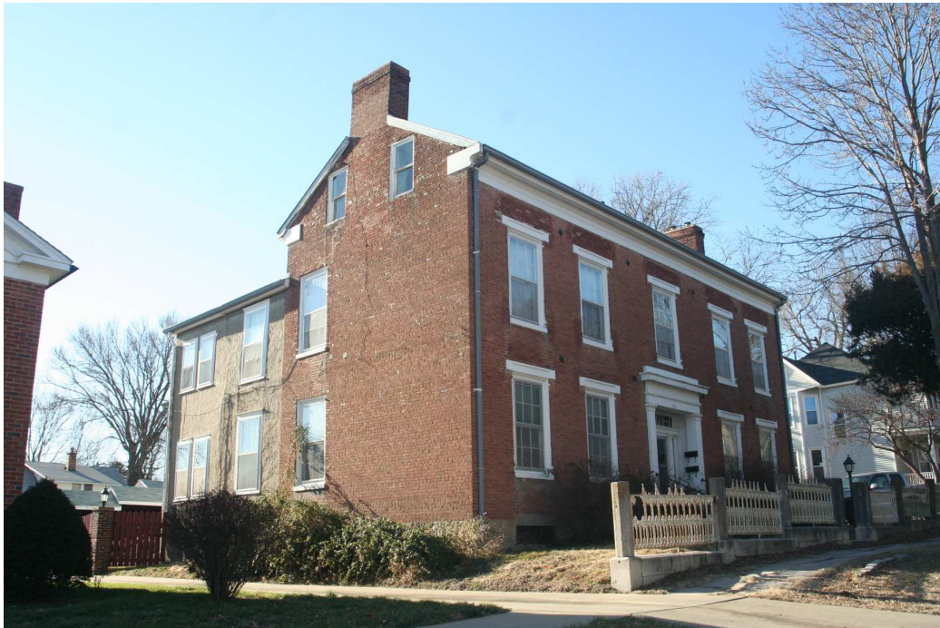
Figure One. Hampton Boon/George Carson House, 404 North Church Street

The John Sears/John B. Clark House, located two doors north of the Boon/Carson House, was also built in the 1830s. The Sears/Clark house is also an I-house, but it is of log construction covered with weatherboards (and more recently vinyl siding) rather than masonry. (Figure Two) Originally located much closer to Church Street, it was moved to its current location in the middle of the lot around the turn of the 20th century. 4 At that time, the central bay front porch was added. According to the Missouri Historic Sites Catalogue , this house has a central hall, fireplaces in each room, cherry built-in cupboards, Dutch doors, and was modeled on a plan of a 1791 Ste. Genevieve house. 5