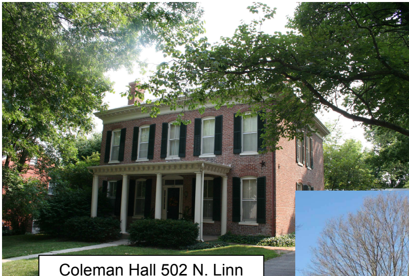
Coleman Hall 502 N. Linn