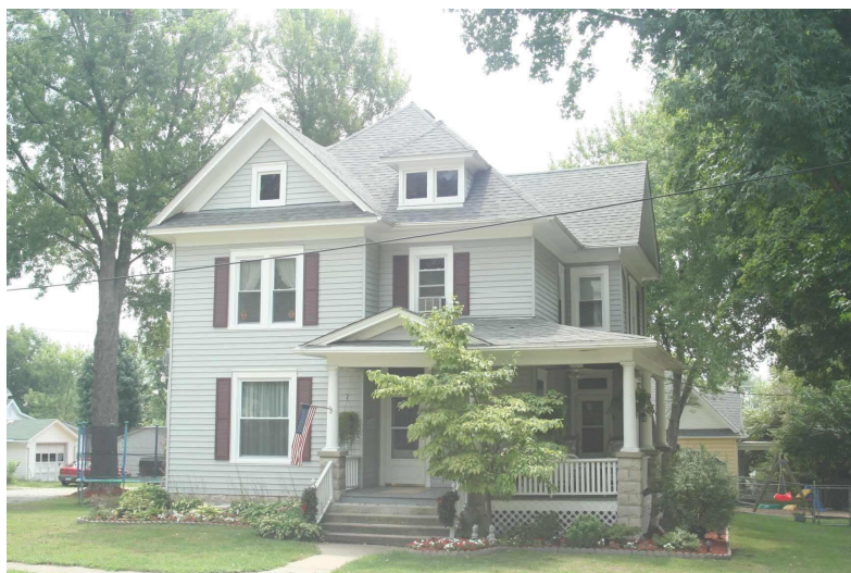
Figure Nine. R. Lee Maupin House, 204 West Spring Street

During the first decade of the twentieth century, Victorian styling remained the preferred choice of homebuilders in Fayette. After 1910, the construction of Victorian houses dropped off sharply. Only three houses with Victorian features were built in the district after 1910. One of these, the R. Lee Maupin House (Figure Nine) demonstrates the lasting appeal of Victorian