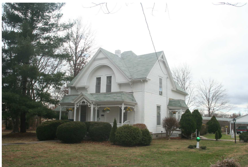
Figure Eight. H. Lawrence Hughes House, 201 South William Street

Twenty-five of the 71 houses constructed in the district during Fayette's second period of development have Victorian features but do not fit into any of the substyles. Unlike high style Victorian houses, these houses are often simple forms such as the Gabled Ell or I-House that have been "dressed up" with Victorian features such as a wraparound porch or gingerbread trim or they have a mix of characteristics from different Victorian substyles. The H. Lawrence Hughes House at 201 South William Street is the most intact of four almost identical Victorian houses in the district. (Figure Eight) These four were probably constructed by the same builder, and their design may have come from one of the many plan books then available. Their most prominent common feature is a large arch recessed into the front gable end. All four houses also have a mix of weatherboard and decorative shingle siding. Each house has a unique front porch. Of the four, the Hughes porch is the most ornate and intact.