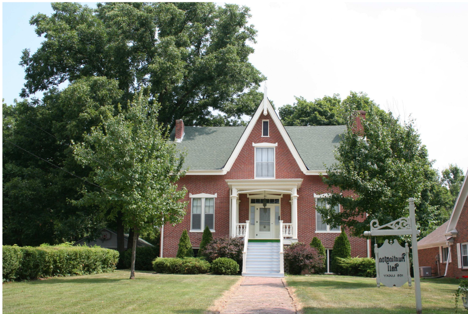
Figure Three. Huntington Hall, 107 Lucky Street

founder of Howard High School and Howard Female College. Lucky owned the house for a decade before reportedly losing it to foreclosure during the Civil War. Dry goods merchant Isaac Pearson was a long-time owner, acquiring the property in 1862 and owning it until 1914. 8 The two and one-half-story brick house has a massed plan featuring a central hall flanked by two rooms on each side. Gothic Revival detailing includes a steeply pitched front gable, tall narrow windows, and pedimented door and window lintels with “ear” detailing. Huntington Hall was undoubtedly one of the first Victorian houses in Fayette.