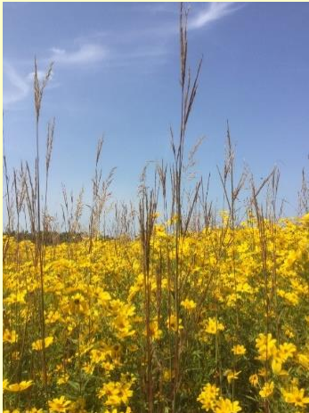
Bur marigold, Indian grass and big bluestem

The next time you visit Prairie State Park, why not get a trail map and go on a treasure hunt?