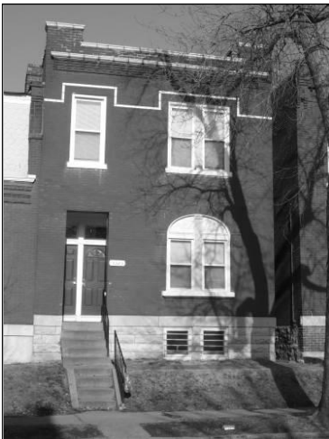
3323 Itasca (second story added)

Within the survey area, there are example with a single bay open porch or recessed porch, most common during the late 19 th century into the first decades of the 20 th , as well as those with a full-width front porch, more common in the teens and 1920s.