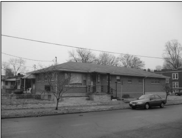
4761 Louisiana at Delor

Duplexes can share the characteristics of other styles and types; their major defining characteristic is the presence of two dwelling units on the same story.