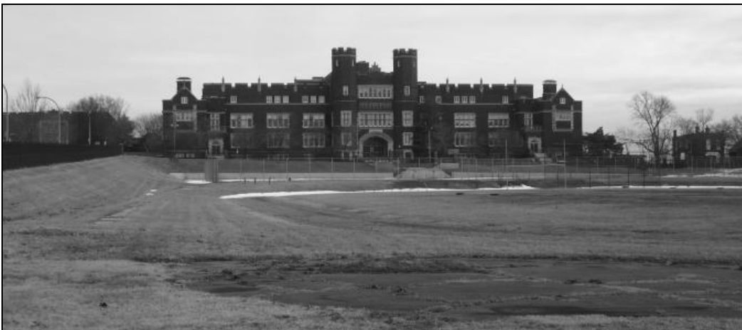
Grover Cleveland High School, 4352 Louisiana (tennis/track/football field, 4352 S. Grand)

The survey area also includes two historic churches with connected Modern-era school buildings, and the individually eligible Grover Cleveland High School and associated playing fields.