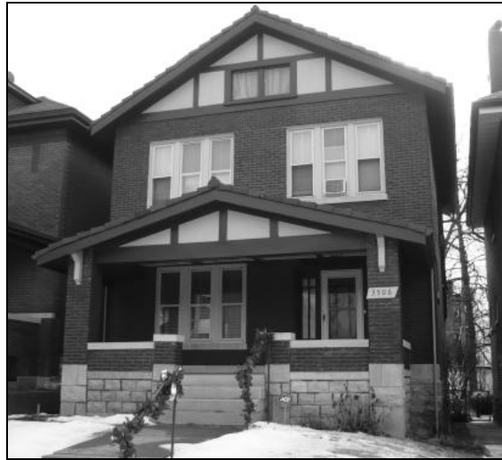
3506 Kingsland Court