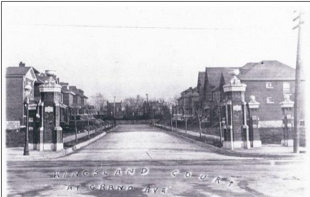
Kingsland Court with entrance gates c. 1916.

Brick entry gates further established Kingsland Court as an exclusive street. According to a building permit issued to H.C. Koenig on September 11, 1911, the estimated cost of the "2 brick & concrete entrances" was $300."