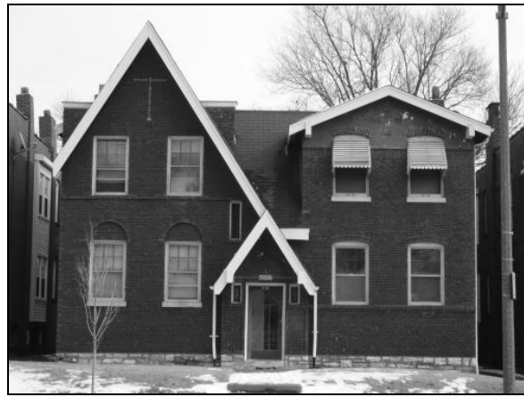
4722 South Grand