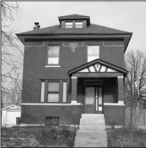
3511 Kingsland Court

The Foursquare house appeared just before the turn of the 20th century. These two or two and a half story houses were constructed in both frame and masonry; have square plans, and pyramidal roofs. Usually the entry is placed to one side under a small porch, although front verandahs were not uncommon. Foursquares may possess the detailing of any architectural style current at the time of construction; but Arts and Crafts influence was by far the most prevalent. The Foursquare interior has an open floor plan with rooms leading directly into one another - a departure from the multiple rooms connected by hallways that was characteristic of Victorian houses. Foursquare houses were built in outlying urban neighborhoods, as well as rural areas across the United States.