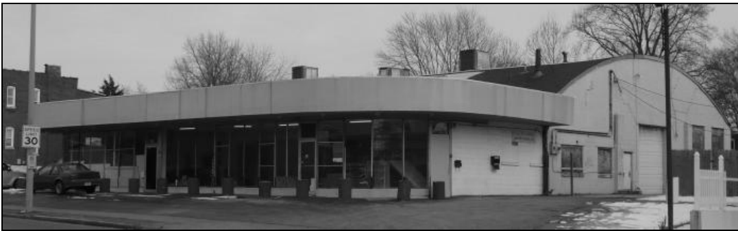
4660 S. Grand

While the survey area developed in part due to the availability of streetcar transportation, several buildings in the period of significance were constructed for auto-related purposes. The gas station at 3453 Delor is heavily altered and is considered noncontributing. In contrast, the auto sales showroom at 4660 South Grand is probably individually eligible for listing because of its unique structure.