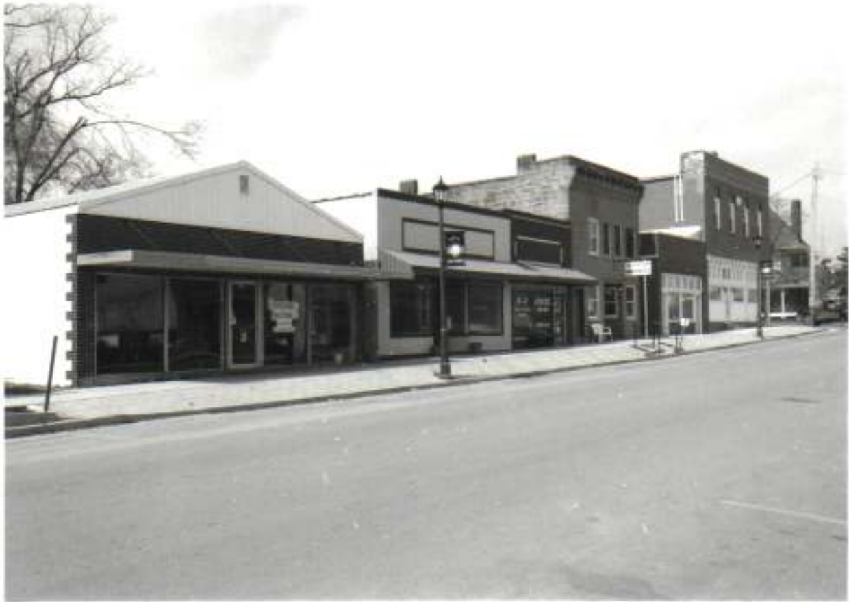
Streetscape #3: Northeast corner of South Smith and NW Main, camera facing northwest, west side of South Smith.