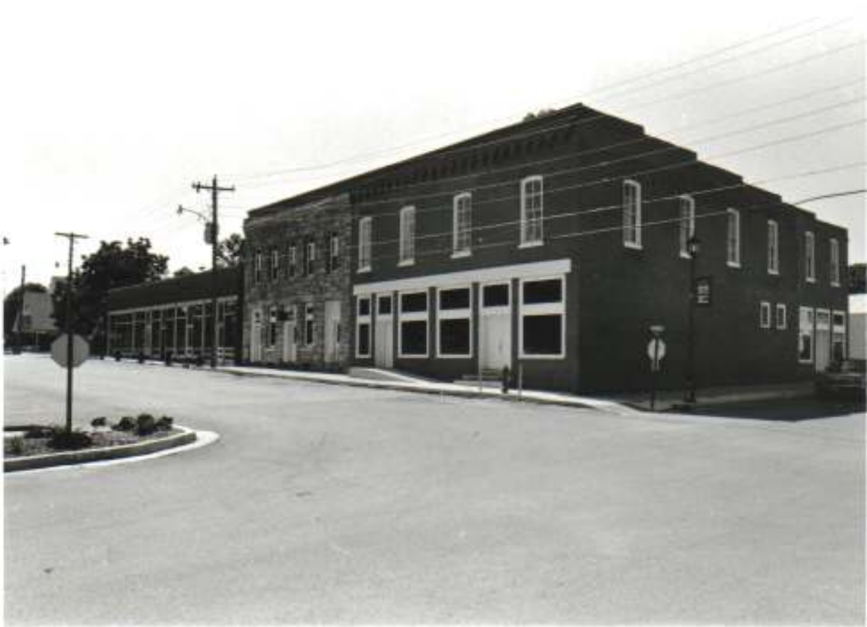
Streetscape #2: SE corner South Smith and NW Main, camera facing northwest, north side of NW Main and west side of South Smith.