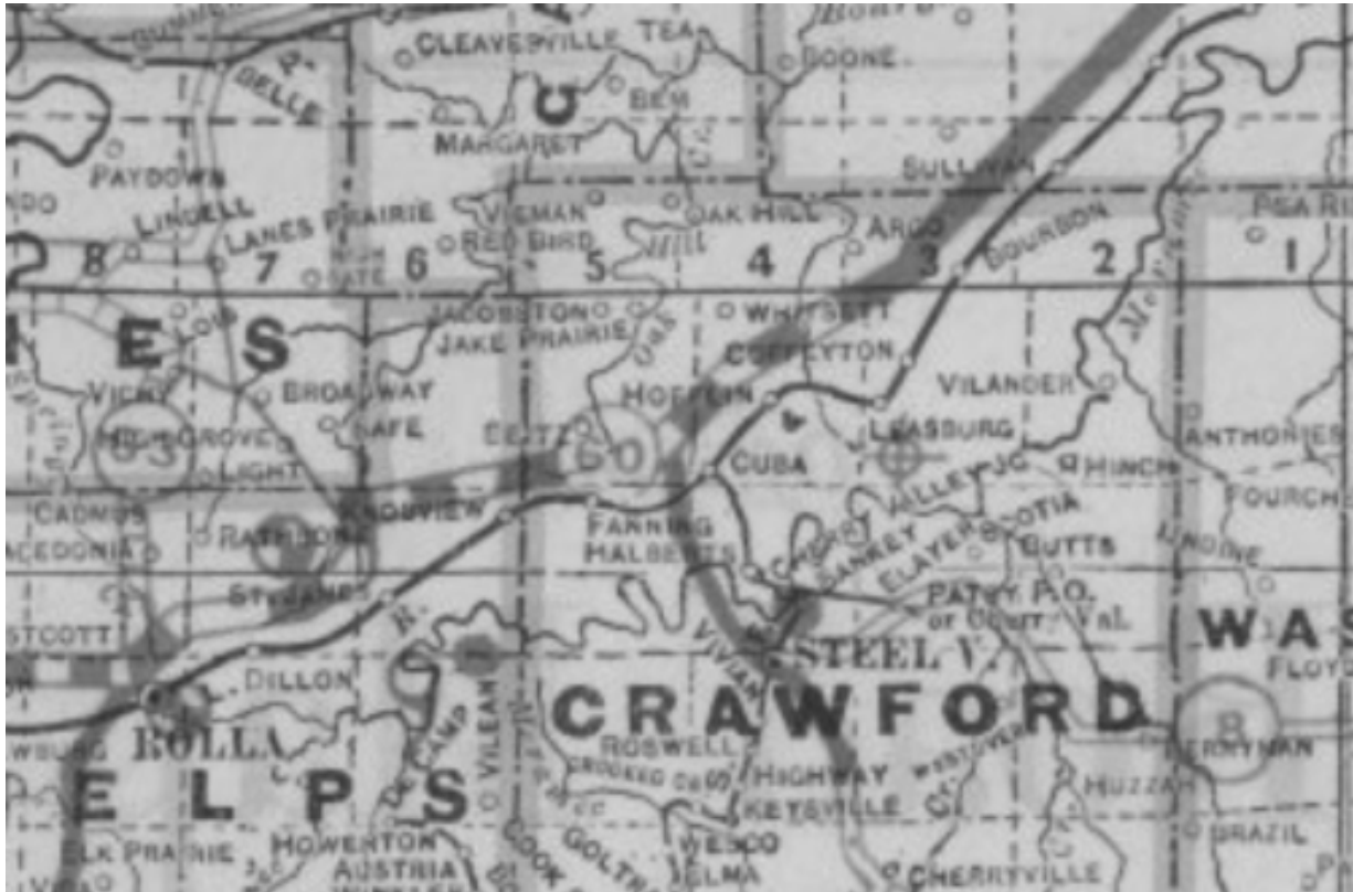
Figure 5: 1926 Missouri Highway Commission state road map, showing overlay of proposed Route 60 (66).

the proliferation of automobiles and the movement to improve Missouri's miserable roads, however, the hotel boom was short-lived.