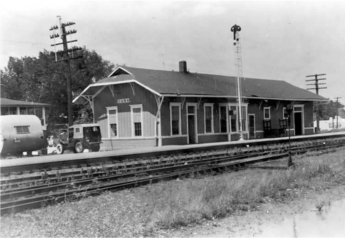
Figure 2: Cuba Frisco Depot. Source: “Depots—Crawford County, Missouri,” The Frisco: A Look Back at the St. Louis-San Francisco Railway . Http://198.209.8.207/lochist/frisco/depots/images/photos/p01131.jpg . Accessed February 20, 2007.

With the end of the war, Cuba resumed its slow but generally steady development, measured primarily by the ebb and flow of new businesses and industries. Beginning in February 1869, at least two iron ore mines near Cuba were under development. The largest such mine was the Scotia Iron Company, organized by a group of entrepreneurs from St. Louis. The mine produced twenty-two tons of iron a day, and 2,300 tons in its first month of operation. Much of the ore produced by the Scotia mine and twenty-two other mines in the area was shipped through Cuba. The Scotia Iron Company was short lived, however, only in operation from 1870 to 1880, when