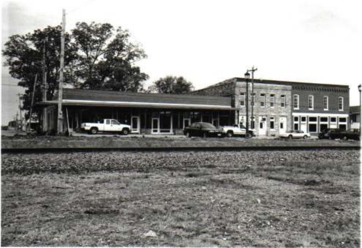
Streetscape #1: North side of NW Main, between South Hickory and South Smith, camera facing northeast.