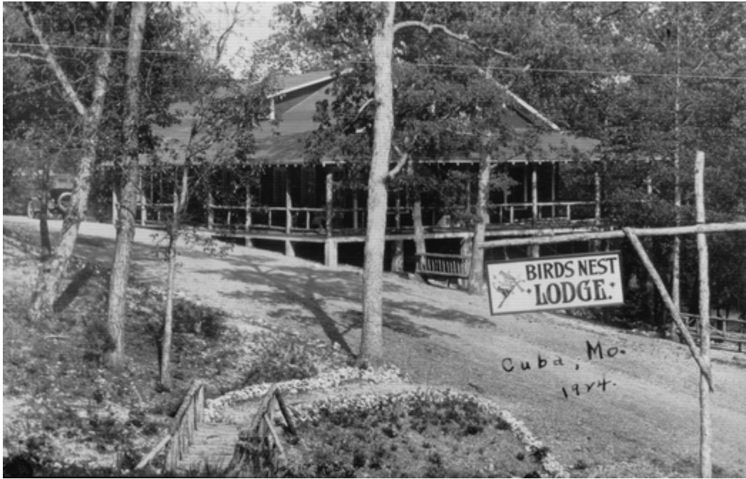
Figure 5: Postcard view of Birds Nest Lodge, near Cuba, circa 1924.

with the original route along Washington Avenue carrying eastbound traffic, and a new road along the northern city limits carrying westbound traffic. 42