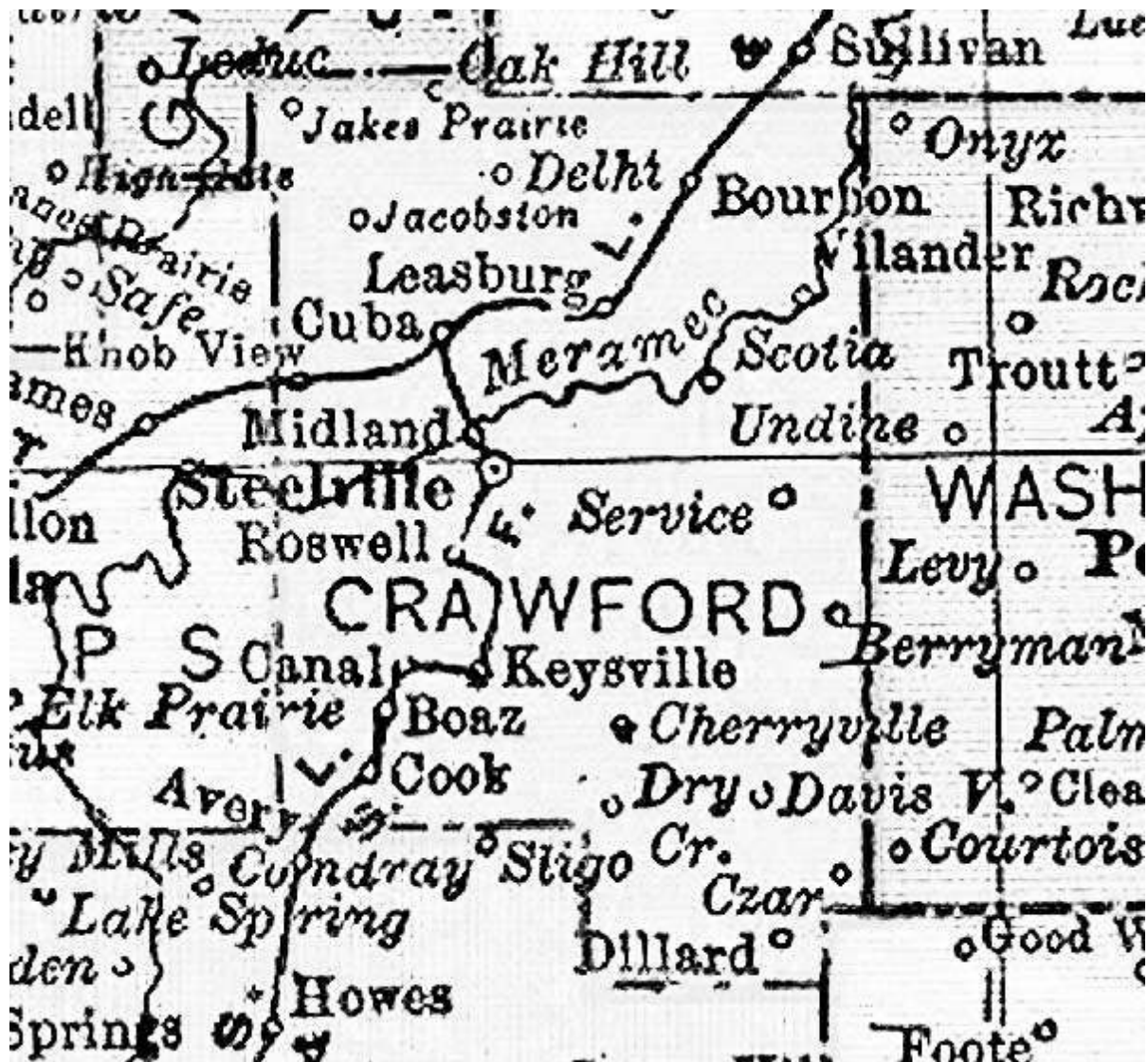
Figure 8: 1895 map of Crawford County, showing the Salem Branch Railroad.