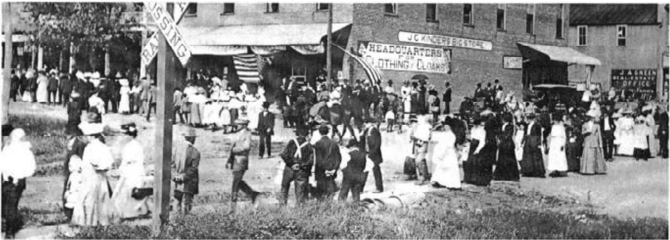
Figure 4: Cuba fair days and J.G. Kinder's Big Store (see form 1), circa 1915. Source: Crawford County History Book Committee, Crawford County, Missouri, 1829-1987 , vol. 1 (Paducah, KY: Turner Publishing Company, 1987).