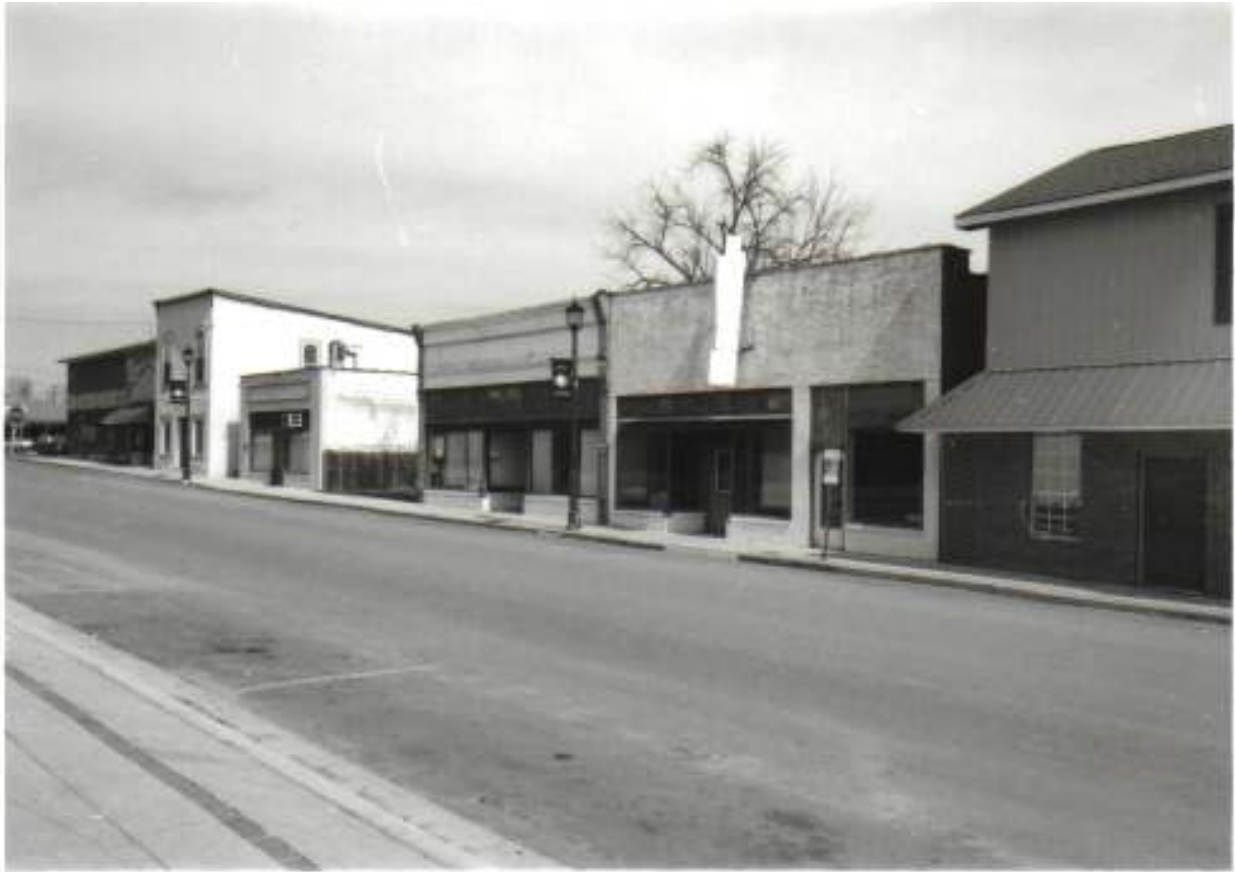
Streetscape #4: NW corner South Smith and NW Main, camera facing northeast, east side of South Smith.