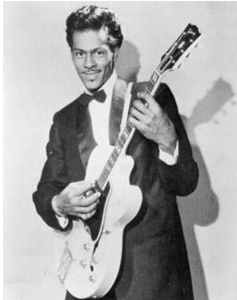
Figure 2: Chuck Berry, circa 1956.

Berry stands to gain nothing by the listing of his former home, whereas the nation stands to gain by the acknowledgment of the building where one of its musical masters crafted the fundamentals of rock and roll. The property can be listed without violating any National Register guidelines. The early period of rock and roll is clearly over, and sufficient time has elapsed for a scholarly appraisal of Berry's contributions to its development. These contributions have been evaluated, with near-universal acclaim. Although Berry is still alive and performing on a limited basis, he is not creating original music nor is he attempting to do so, and therefore his productive career is over.