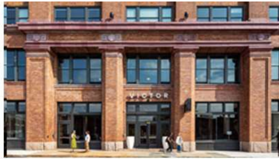
Left and Right: Before and After rehabilitation; the newly cleaned façade highlights the beauty of the building's purple terracotta, orange brick, and pink Missouri granite.