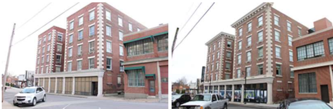
Left and Right: Before and After the 2016 rehabilitation of the H&H Building and the Rueseler Motor Company Building in Cape Girardeau. During rehabilitation a decorative parapet was returned to the H&H Building based on photographic evidence of its historic appearance.