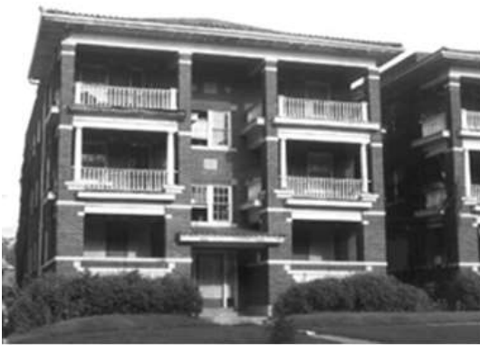
Left: Nelle Peters, 4808-10 Oak Street Apartments, Kansas City, 1924.