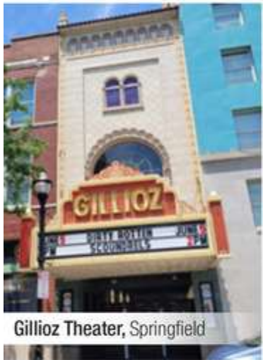
Gillioz Theater, Springfield