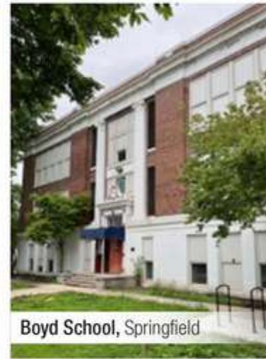
Boyd School, Springfield