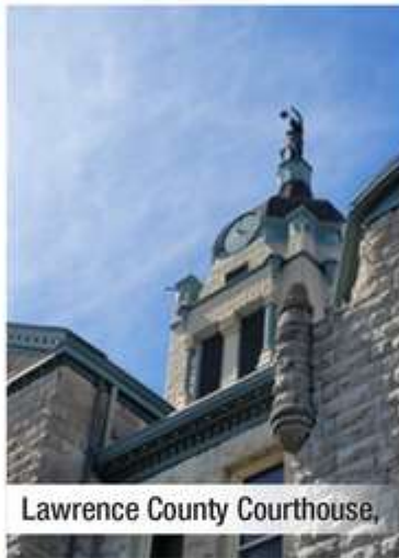
Lawrence County Courthouse,