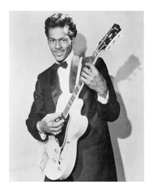
Figure 2: Chuck Berry, circa 1956.

Berry stands to gain nothing by the listing of his former home, whereas the nation stands to gain by the acknowledgment of the building where one of its musical masters crafted the fundamentals of rock and roll. The property can be listed without violating any National Register guidelines. The early period of rock and roll is clearly over, and sufficient time has elapsed for a scholarly appraisal of Berry's contributions to its development. These contributions have been evaluated, with near-universal acclaim. Although Berry is still alive and performing on a limited basis, he is not creating original music nor is he attempting to do so, and therefore his productive career is over.