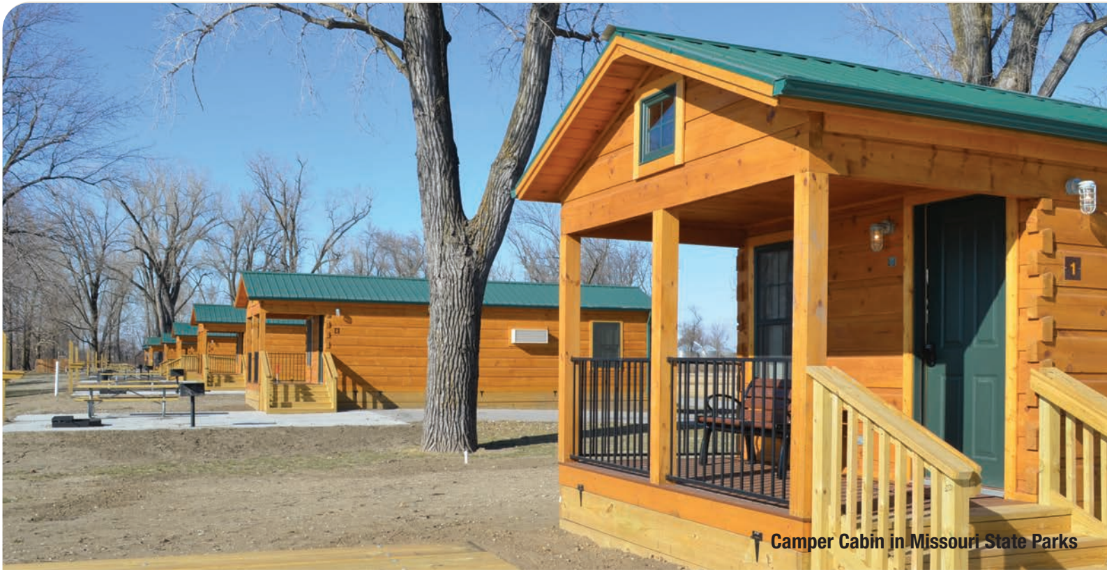
Camper Cabin in Missouri State Parks