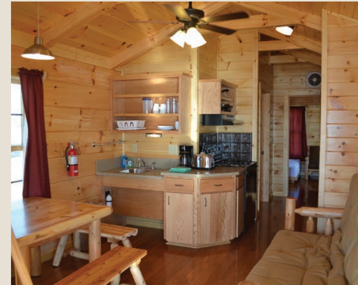
Camper Cabin Interior

Missouri state parks have featured camper cabins for more than 15 years. Camper cabins provide a low cost overnight opportunity for visitors that want to experience state parks. The occupancy for premium camper cabins is consistently high, demand exceeding availability. Camper cabins are a great option in flood prone areas because they can be easily moved to higher ground.