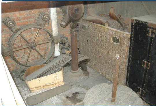
Artifacts from the museum's "attic"