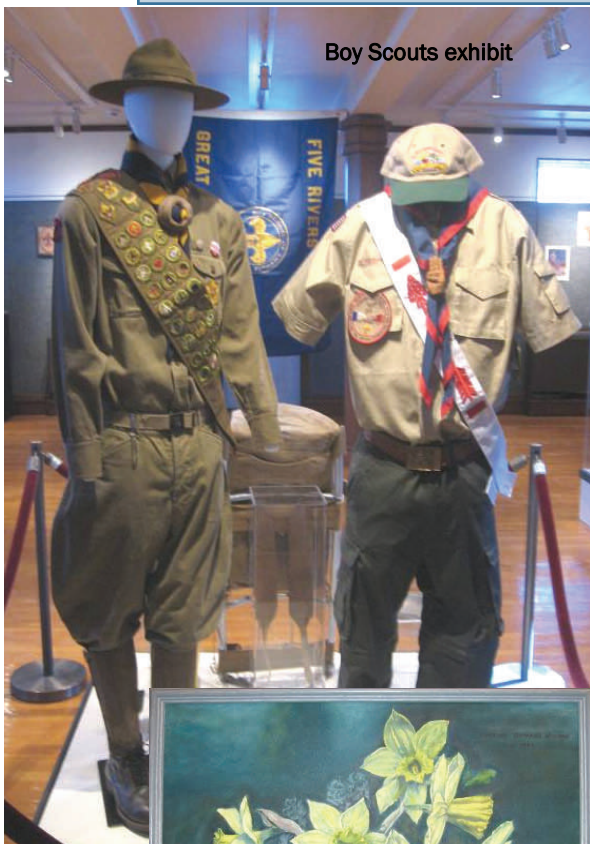
Boy Scouts exhibit