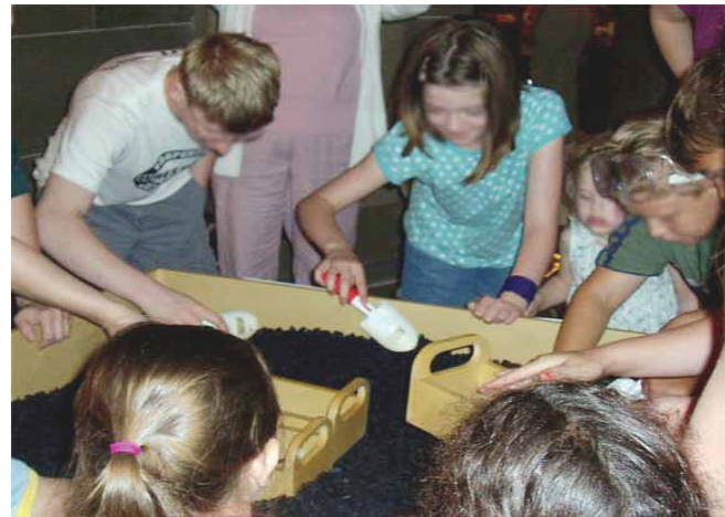
Tuesdays at Two 2009: "Can You Dig It?" archaeology program