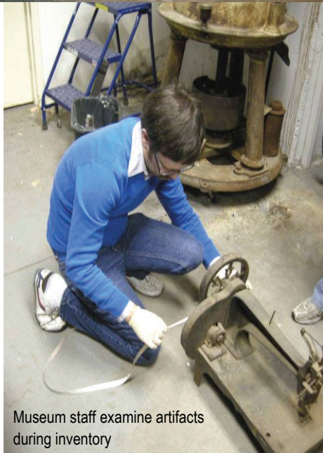
Museum staff examine artifacts during inventory