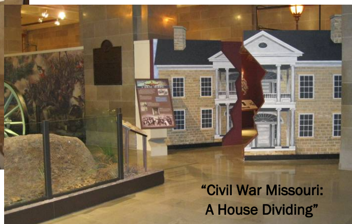
“Civil War Missouri: A House Dividing”