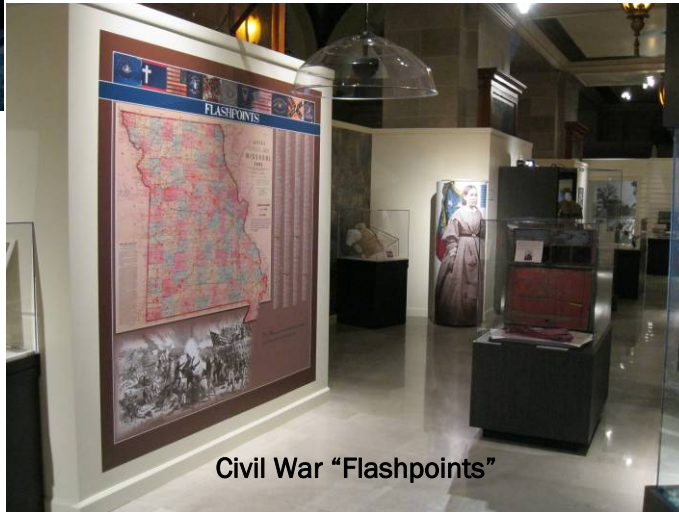
Civil War "Flashpoints"