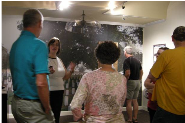
Friends group hosts "curator's tour" of Civil War Missouri exhibit in June

Did you know the State Museum has a friends group? The Friends of the Missouri State Museum recently received its official 501(c)3 status as a non-profit organization. Its mission is to support and advocate for the museum. The Friends have already raised funds and committed them to two museum projects. They will purchase reproduction