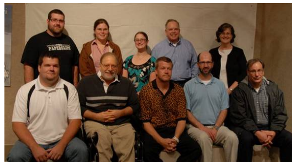
Friends of the Missouri State Museum board members

http://www.facebook.com/MissouriStateMuseum.1821